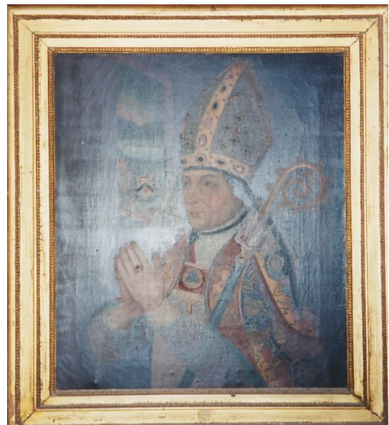
John Leslie, Bishop of Ross.