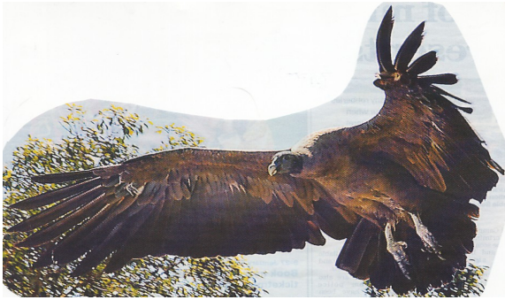
LESLIE, The Andean Condor

Taronga Zoo in Sydney New South Wales has a new major attraction. It is a four year old Andean Condor, with a wing span of 3 metres.