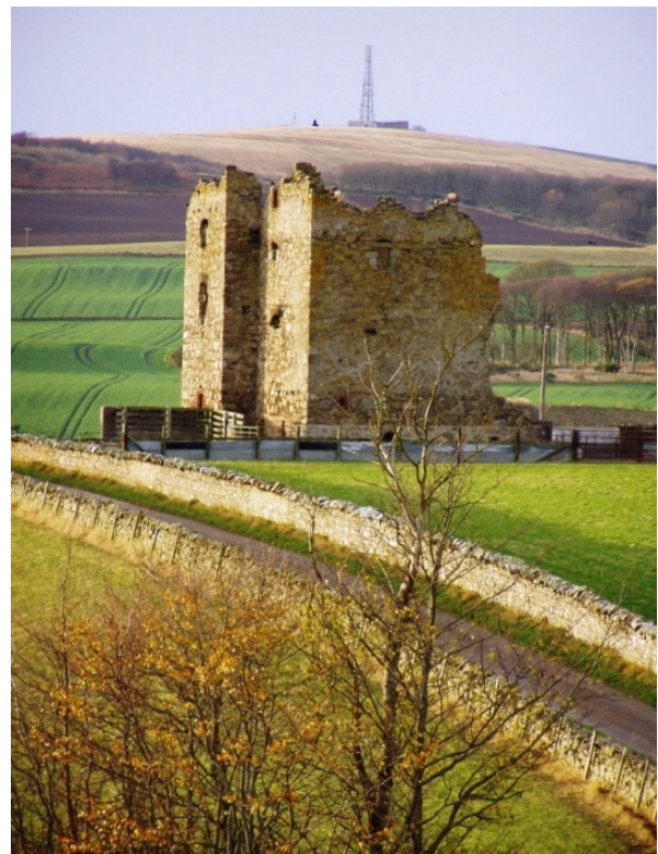
Eden Castle Deveron River, Banff. Banff

Eden Castle is about 3 ½ miles from Banff in Aberdeenshire. It was originally a Z plan Tower Castle built by the Meldrums in 1577.