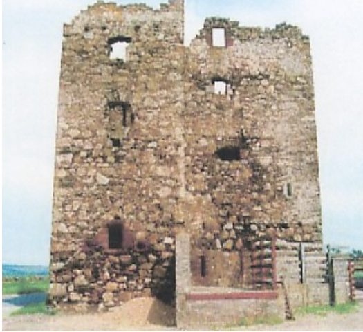
Eden Castle from the rear.