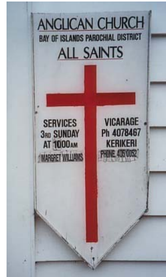
Plaque on the outside of All Saints Church at Kaero.