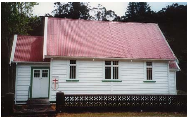
All Saints Anglican Church, Kaero North Auckland NZ.