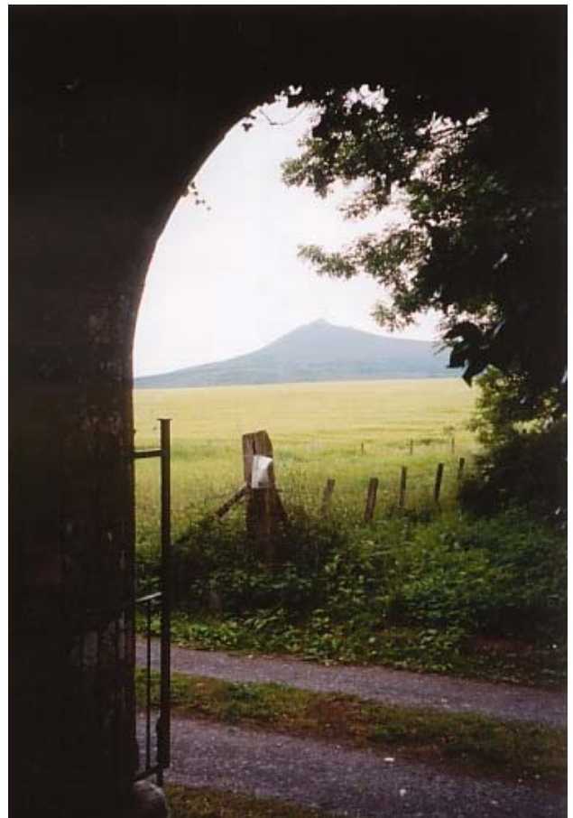
"Bennachie" from The Chapel of Garioch Cemetery

Bennachie is often considered as being part of the lands of the Leslie's of Balquhain, but during the Highland Clearances it was found to be Crown land and the highlanders who had camped there were moved on by the surrounding landholders with great difficulty