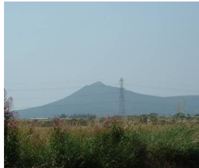
Hill of Bennachie