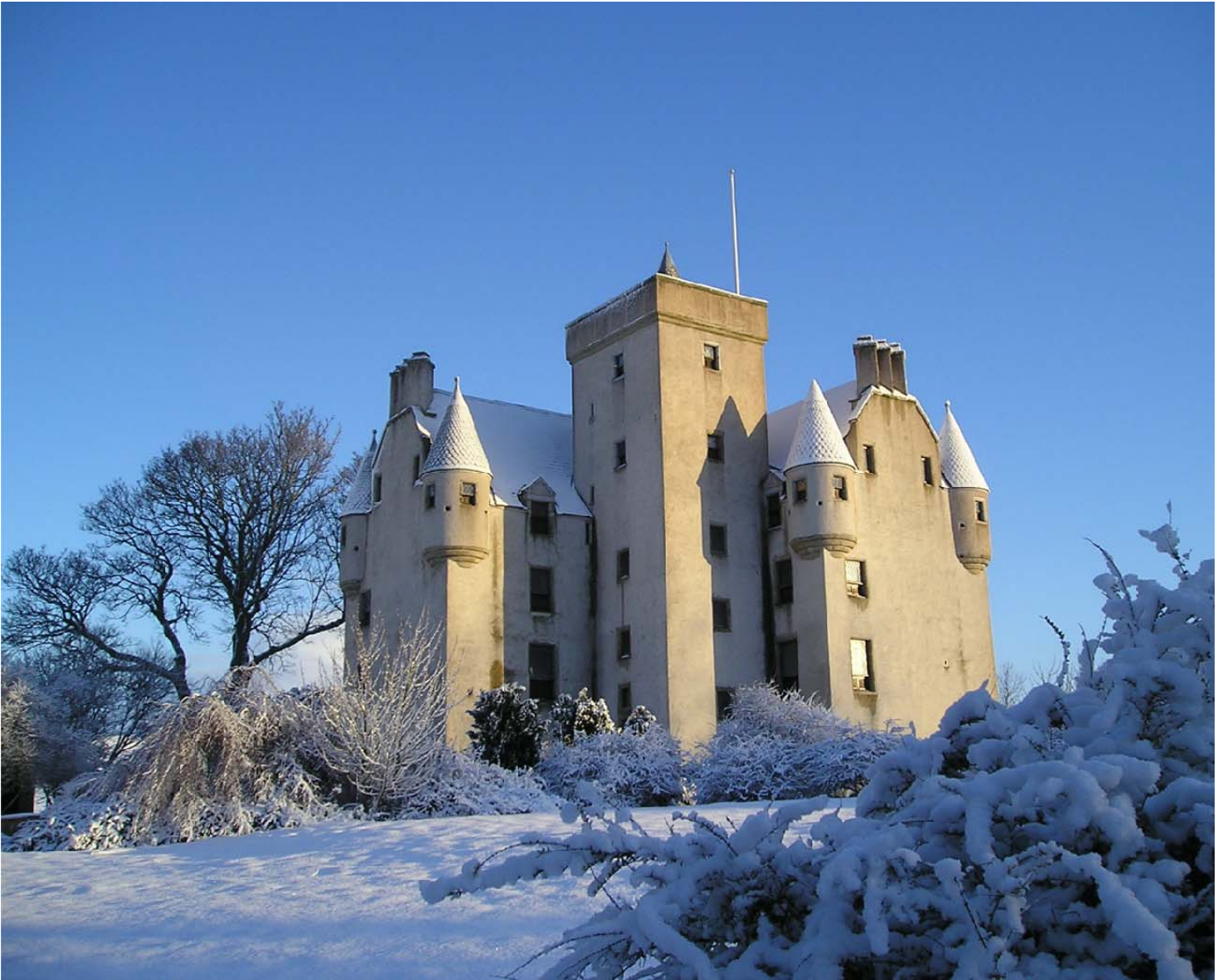
LESLIE CASTLE, LESLIE, ABERDEENSHIRE..... DECEMBER 2010