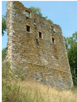
Ruins of Balquhain Castle