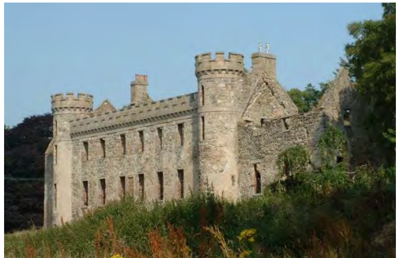
CHAPEL OF THE GARIOCH, REMAINS OF THE TOWER OF THE CASTLE OF BALQUHAIN, HARLAW MONUMENT, LESLIE CASTLE, THE HILL OF BENNACHIE FROM BALQUHAIN CASTLE, LESLIE STAINED GLASS WINDOW IN ST. JOHN'S CHURCH, FETTERNEAR CASTLE