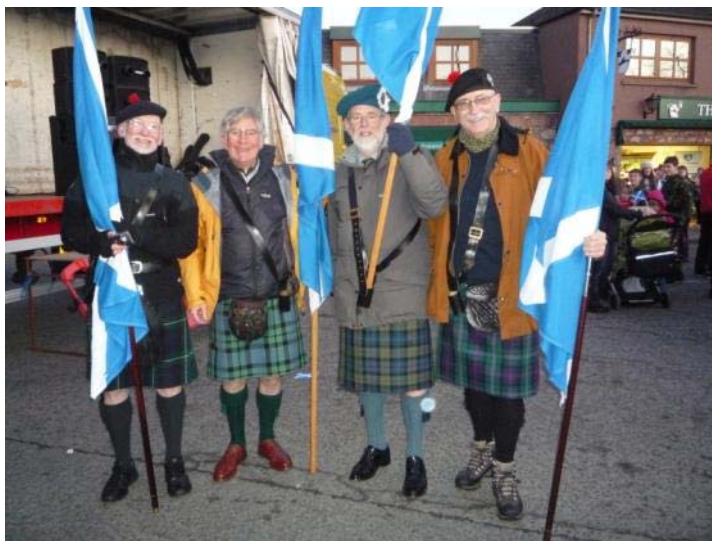
More Freens o Reid Harlaw

The afternoon was a great success and the Freens made many useful contacts for the future along with a number of potential new members.