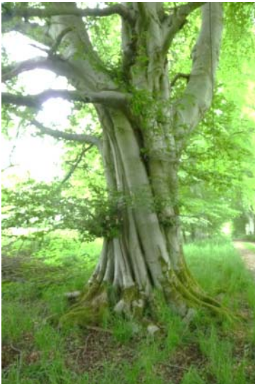
One of the Old Trees Lining the Driveway to Warhill