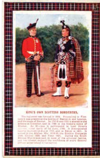
Left: A vintage postcard (undated) of a KOSB officer in Leslie trews and a KOSB piper in Royal Stewart.