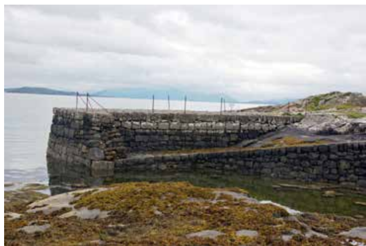
The dock at Grass Point