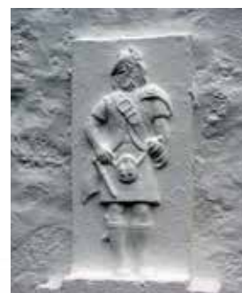
A decoration on the house at Grass Point (left) and a bridge near Grass Point (below)