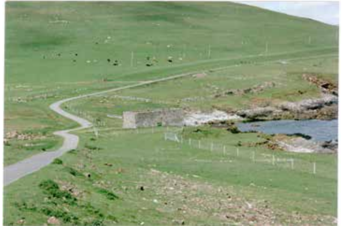
The ruins of Garthbanks, Dunrossness, Shetlands. Once an important fishing station, all that remains are the walls of the Hays & Company warehouse from which they conducted the truck system business with the crofter fishermen. The rocks in the foreground were where the boys who served on the beach carried the fish to be dried.