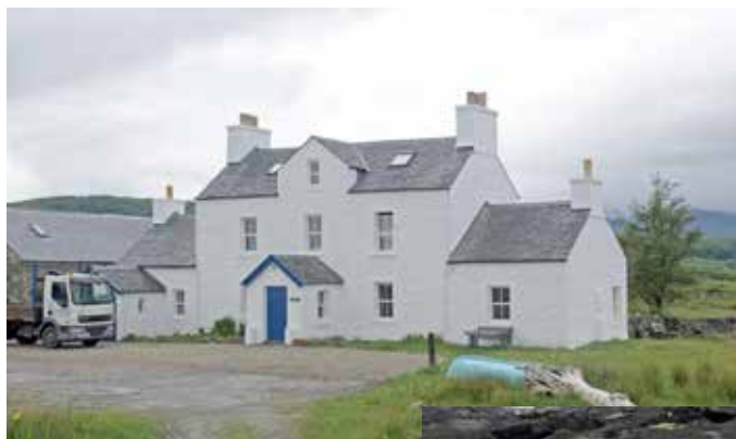
Lionel Leslie's house at Grass Point (top), a seal sculpture at Grass Point (right)

The “inn” had been an inn for cattle drovers who would wait there for boats to carry them and their cattle to Oban on the mainland, across the Firth of Lorn. The “inn” was a three story ten room building, with two roofless side wings and a roofless cattle barn beside it. Lionel offered to rent this inn, to the