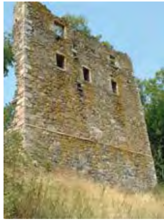
Ruins of Balquhain Castle