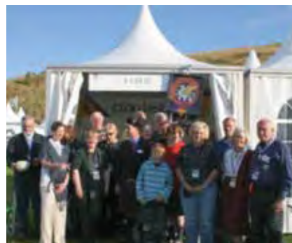
Leslies at the 2009 Homecoming Gathering in Edinburgh