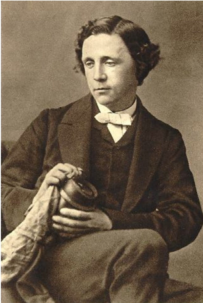
Charles Lutwidge Dodgson [Lewis Carroll]