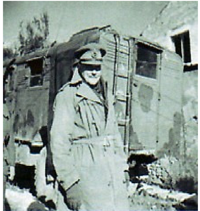
Lt Gen Bernard Freyberg. VC. GCMG.KCB.KBE.DSO

Commission in the Hood Battalion of the newly constituted Royal Naval Division. In 1915 Freyberg became involved in the Dardanelles Campaign. During the initial landings by Allied troops following the unsuccessful attempt to force the straits by sea, Freyberg swam ashore in the Gulf of Saros. Once ashore he began lighting flares so as to distract the defending Turkish Forces from the real landings taking place at Gallipoli. Despite coming under heavy Turkish fire he returned safely from this outing and for this action he received the Distinguished. He received serious wounds on several occasions and left the peninsular when his division was evacuated in 1916.