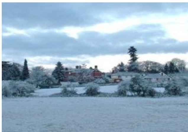
Wilcroft House Lugwardine Herefordshire.