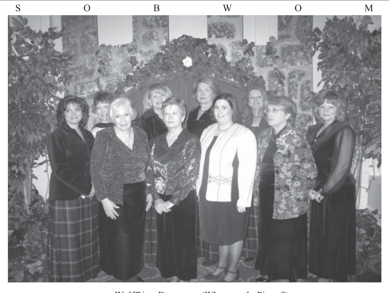
Wolf River Drummers (Where are the Pipers?)