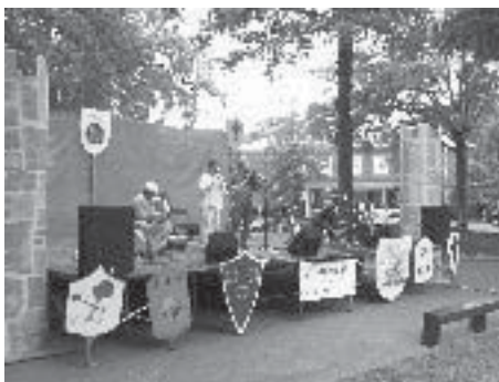
The Music Stage