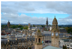
Paisley Skyline from webpage