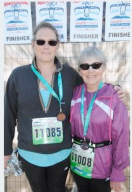
OCTOBER Victoria Park Marathon