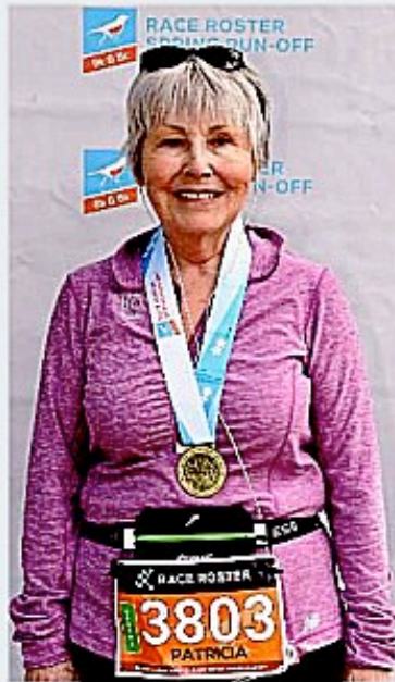
APRIL (High Park) Race Roster Spring Run Off