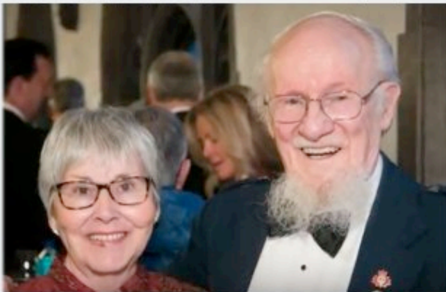
APRIL 20 - Hart House Tartan Day Dinner