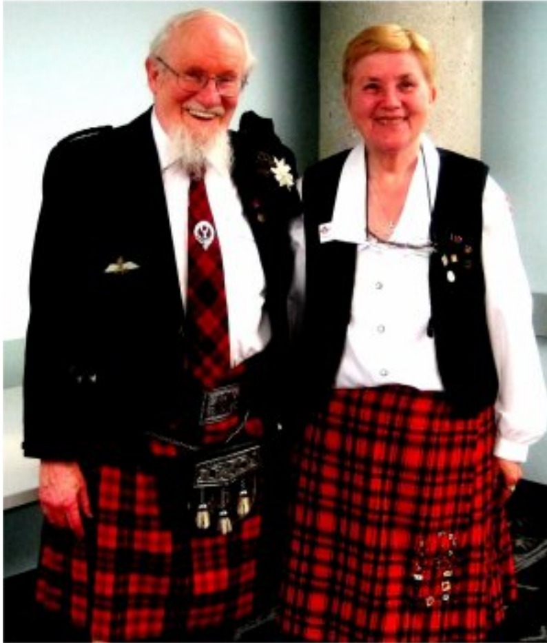
CASSOC AGM - November 13, 2016