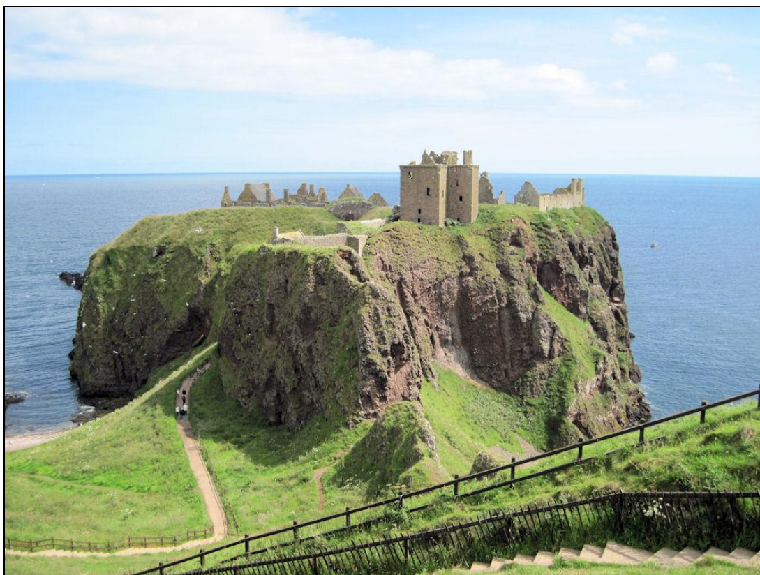
Donnottar Castle, near Stonehaven