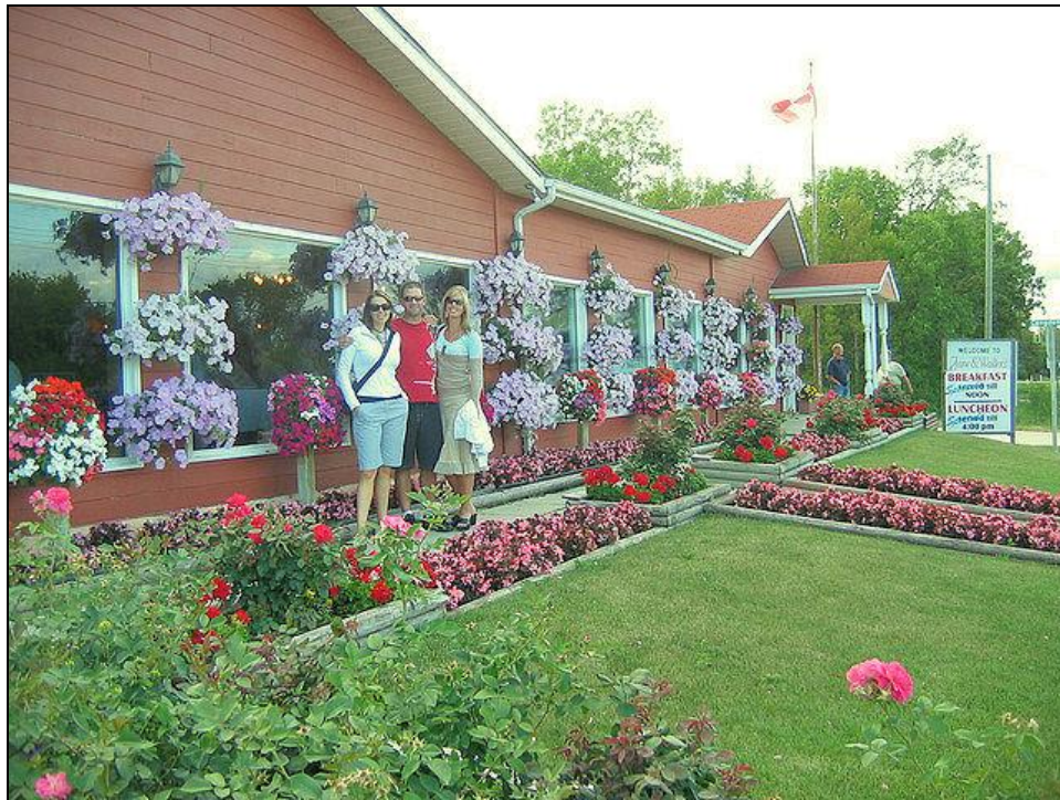
Beautiful flowers adorn Jane & Walter's Restaurant at Sandy Hook

* Monday noon will feature a fresh Lake Winnipeg pickerel fish-fry with all the trimmings at Jane & Walter's family-style restaurant in Sandy Hook, a summer beach resort.