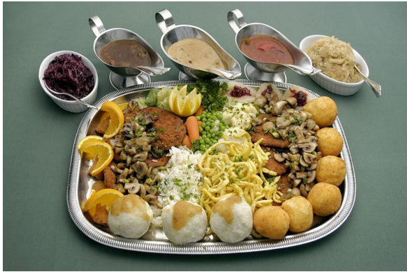
Gasthaus schnitzel platter ... yum !!