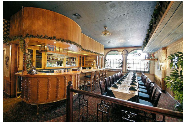
Interior of Gasthaus Gutenberg German restaurant

* Monday noon will feature a fresh Lake Winnipeg pickerel fish-fry with all the trimmings at Jane & Walter's family-style restaurant in Sandy Hook, a summer beach resort.