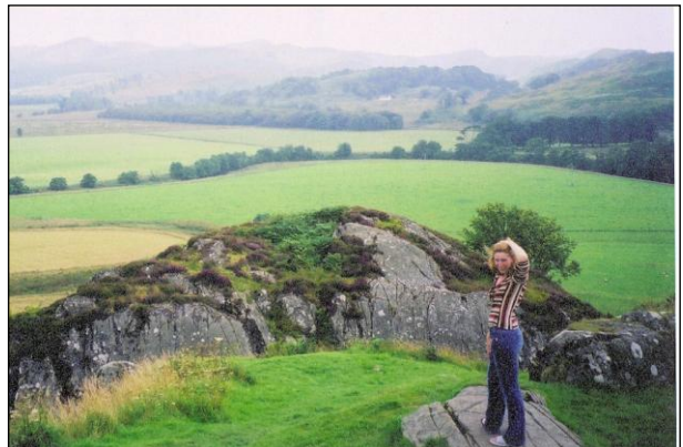
Dunadd with the Royal Lizz