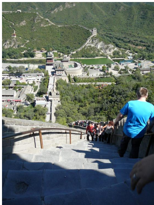
(Right) The Great Wall slopes down steeply to the castle courtyard where the concert took place

It was thrilling! On the tour bus we exclaimed: “How could we top that?” “Well”, the lead Pipe Major suggested, “How about playing on the Great Wall of China?” Our tour guides were consulted, but we were dismayed to find that the long list of regulations included a complete ban on the playing of musical instruments. But the P/M did not give up. Phone calls were made, a collection was taken, and $300 CDN changed hands.