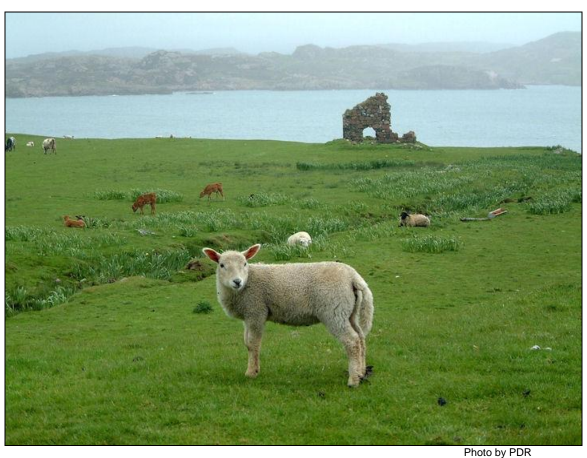
Isle of Iona, Scotland