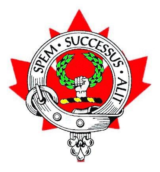
An Cirean Ceann Cinnidh