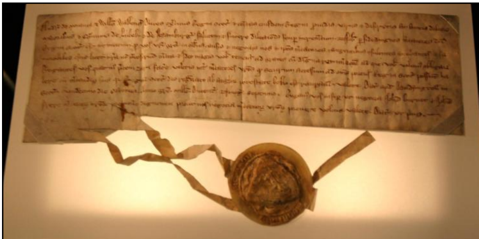
The Lubeck Letter (1297), which led to a reassessing of Wallace's formative years.

What is said to be known of Wallace is that he was born somewhere between 1270 and 1275, that birth for many years thought to have taken place in Elderslie. His father for nearly seven centuries was said to be Malcolm Wal-