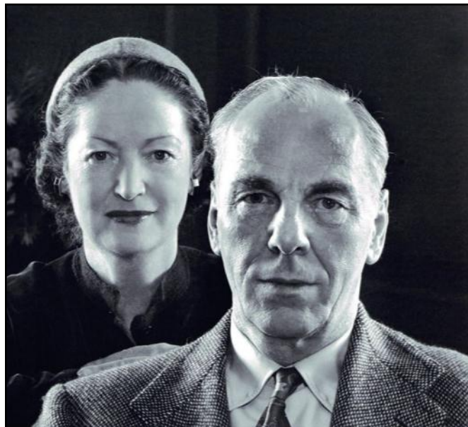
Lila Acheson Wallace and her husband, DeWitt.

The first official edition of Reader's Digest appeared in February 1922. Most magazine publishers readily granted re-publication rights, for they considered a credit in the Digest a form of free advertising for their periodicals. In its early years the Digest itself carried no advertising and was sold solely by subscription. On that basis the magazine grew slowly, but steadily. In 1922 Wallace was able to