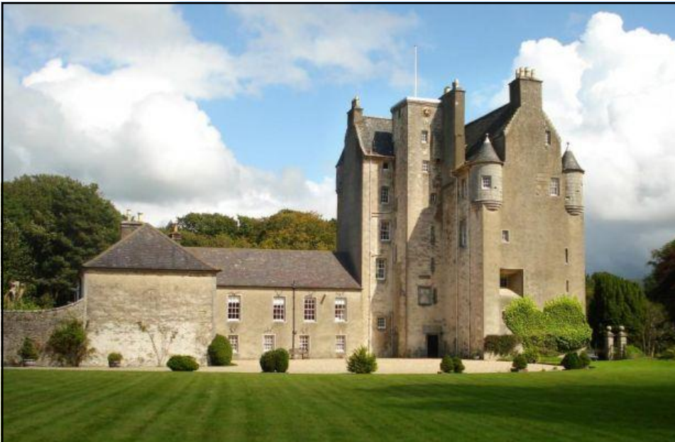
Killochan Castle was constructed in the 14th century, and has a rich history.