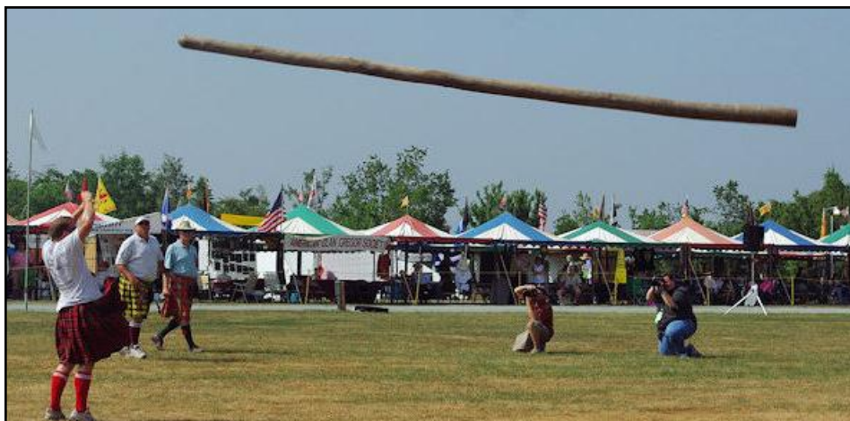
Clan tents are a feature of Scottish gatherings, promoting community and culture.