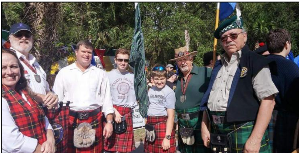
Wallaces Line Up for Clan March at the 2016 Central Florida Scottish Highland Games.

A storm during Saturday night destroyed many more tents in the Village area leaving twisted steel tent structures and their shredded tent tops taller than two men piled up. Sunday