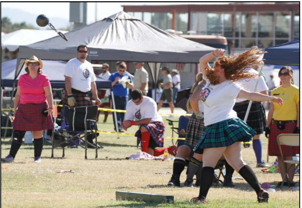
Women's Hammer Throw at the Tucson Celtic Festival in November.