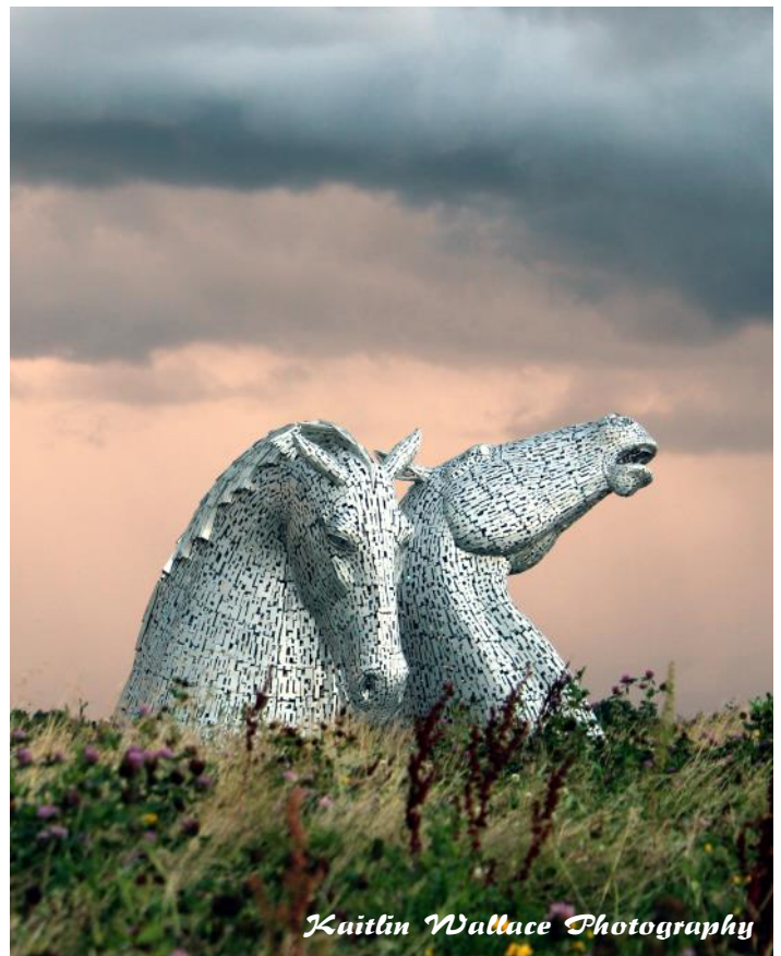
Kaitlin Wallace Photography

Kaitlin is an avid photographer who is always out and about trying to build her portfolio. She just returned from Germany with another spectacular collection of photographs. You can follow her photography on Instagram at #kaitlin.wphotography