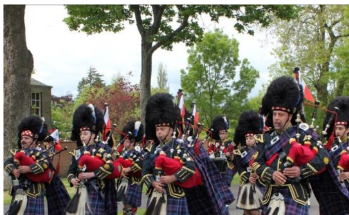
Performing at the Queens Diamond Jubilee Celebration. Wearing the Heritage of Scotland Tartan, now retired