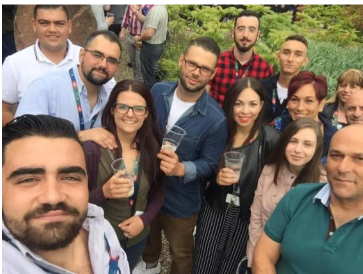
Enjoying a cold pint at the cast BBQ, Edinburgh