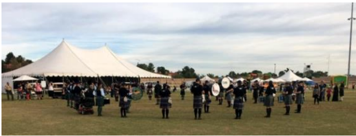
Closing ceremonies, Tucson