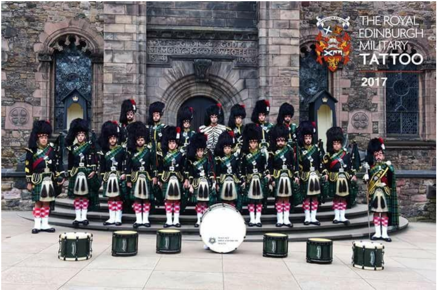
2017 Royal Edinburgh Military Tattoo, Splash of Tartan