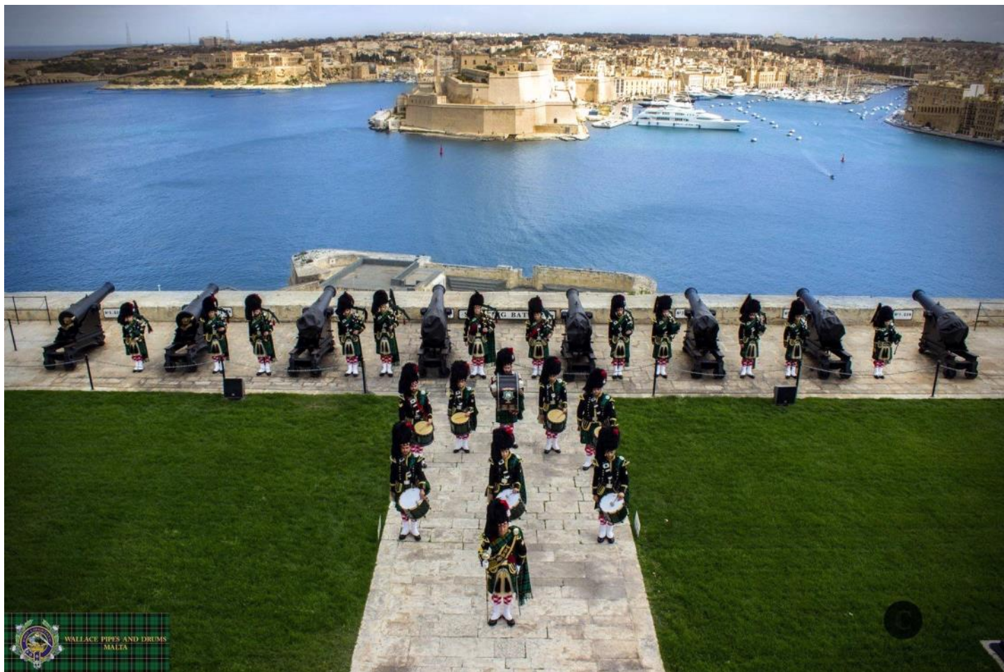
Wallace Pipes and Drums-Malta