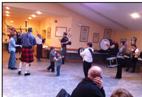
Clan Wallace was represented at a colorful celebration of Tartan Day at Sylvan Lake, Alberta.