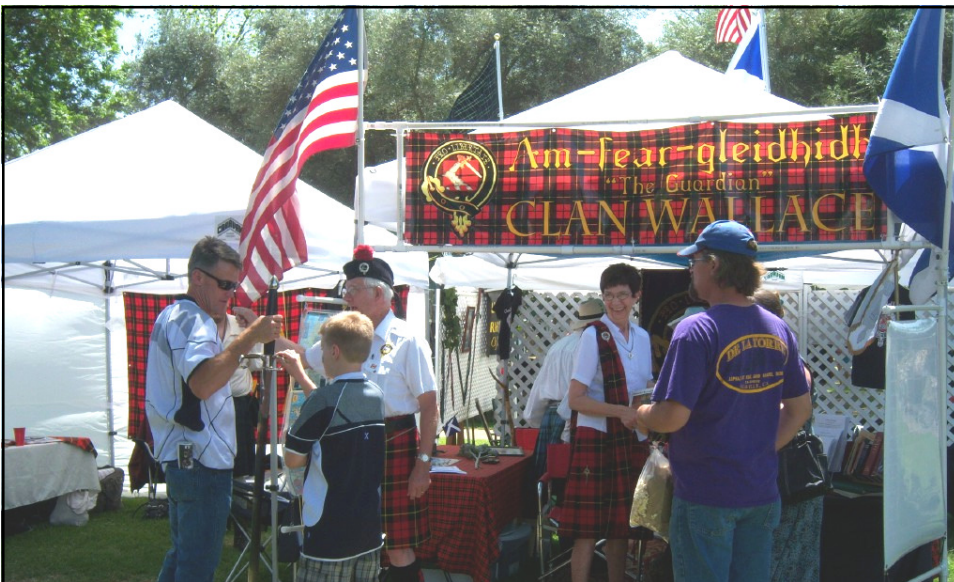
Sir William Wallace's sword drew many, many visitors to the clan tent at Sacramento this year.

The entertainment included the Lindsay Pipe Band, Jamestown Pipes and Drum, and the NC State Pipe Band. There were heavy athletics, Children's Highland games