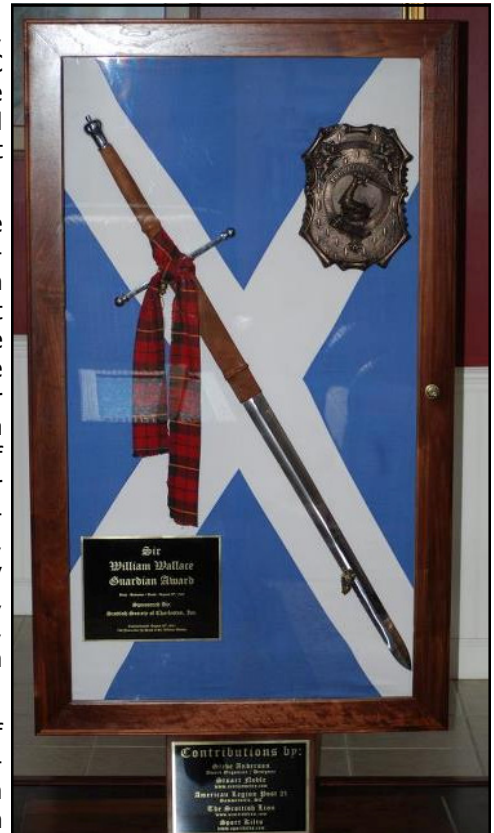
The Sir William Wallace Guardian Award.

I was particularly honored to be selected by him to participate in the ceremony of its