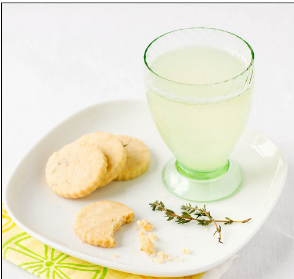
Lemon-thyme shortbread cookies along with a tall glass of lime-in-da-coconut!

1 ½ cups ice 3 Tbsp. frozen Limeade (or Lemonade) Concentrate 2 oz. Coconut Rum