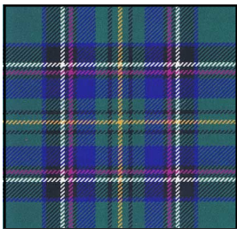
Tartan of the Canmore Highland Games

There is still room on the buses and still time to register for what promises to be a wonderful get together in Calgary and Canmore. What places to renew acquaintances! What a place to launch a vacation in the Canadian Rockies – Banff and Jasper National Parks, Lake Louise! Perhaps the