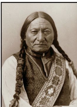
After Little Big Horn, Sitting Bull's presence in the NWT posed a problem for the NWMP.

References: All input for this article is by courtesy of the Royal Canadian Mounted Police ( www.rcmp-grc.gc.ca ) These stories, and many others, are available for you to read in the books available at their website.