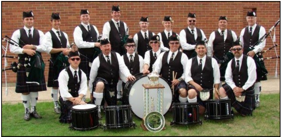
Members of the North Texas Caledonian Pipes & Drums.