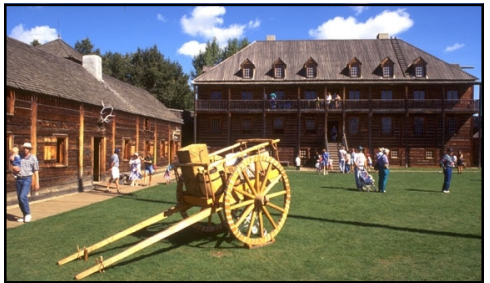
Fort Edmonton Historic Site, as it is today.

On his return from Fort Benton, the Commissioner set out with two troops for Swan River, the newly appointed headquarters of the Force. Assistant Commissioner James F. Macleod, commanding "B", "C" and "F" Troops and the remainder of "A", continued westward to the foothills. Although he did not know it at the time, the most significant thing the Commissioner did at Benton was to hire the services of a guide, Jerry Potts, whose father was a Scottish fur trader and his mother was a Blackfoot Indian. (He stayed with the NWMP for 22 years and provided tremendous service as a guide, interpreter, and scout.)