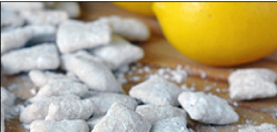
Lemon Buddies: delicious little powdery bites of bright lemony sunshine!

Microwave for one minute then stir. Continue to microwave in 30 second bursts