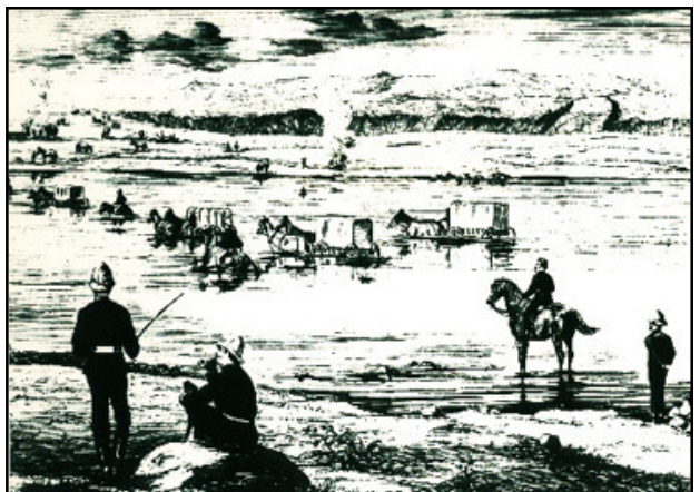
Northwest Mounted Police crossing the Belly River, 1874.