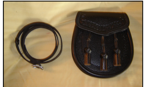
This day sporran is one of many items that will be auctioned this August at the Gathering.