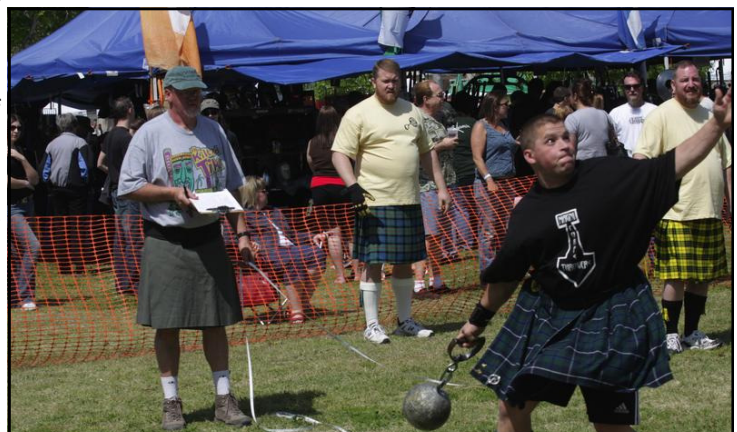
Throwing the shot at Bakersfield, CA.

The following Monday, it was once again on up the highway in the direction of the next weekend's event. From Bakersfield we stopped in the California Delta region for a few days before going on up the Interstate to Woodland, about 20 miles north of Sacramento, for the 136th Sacramento Valley Scottish Games and Festival. Their annual event, typically held on the fourth weekend of April, is one of the more enjoyable Scottish events along the west coast. Not too warm, usually not even close to chilly.