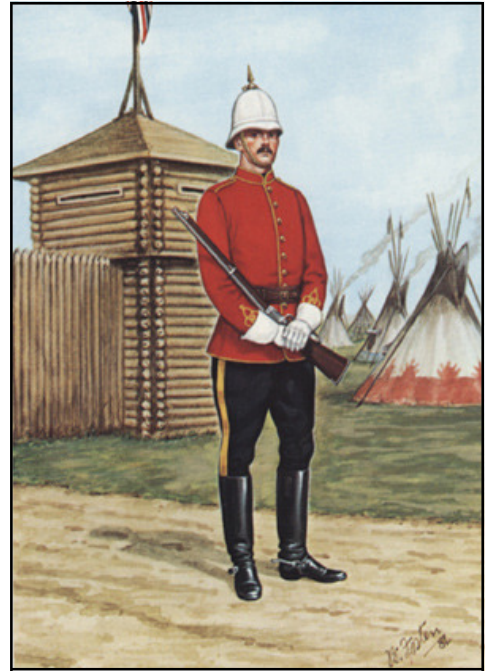
Artist's rendering of a NWMP Constable, 1880's.

The rest of the story, as they say, is history. Today, the Royal Canadian Mounted