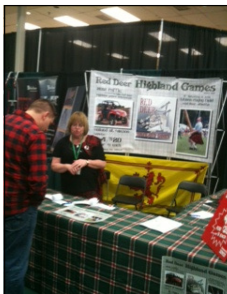
Selling raffle tickets is a great way to fund-raise and to raise awareness of events.