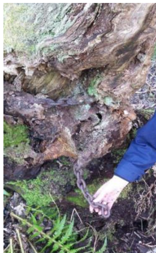
Wallace Yew Tree and Chain