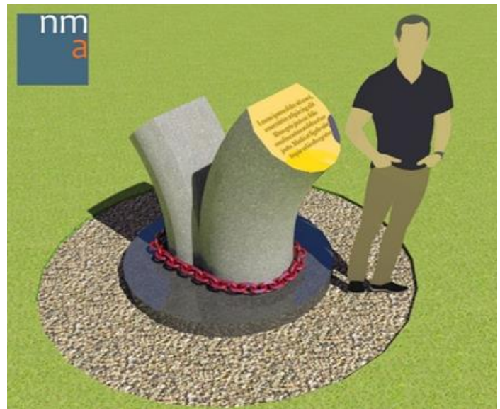
Artists Rendering of the Monument