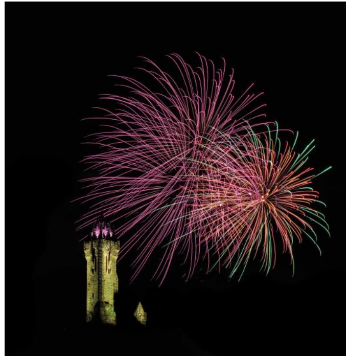
The Wallace Wha Hae! festival will feature a light show and firework display.

The festival, which has been partly funded by EventScotland, will also host a traditional funfair and an arts and craft area for mini festival-goers, who will be able to create their own Wallace sword and join in creating a ping-pong saltire.