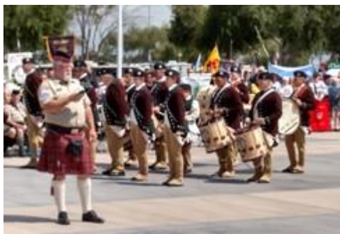
Los Angeles Fifes and Drum