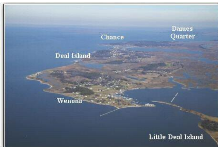
Aerial view of Dames Quarter and Deal Island

The Washington Inn, Princess Anne Maryland. Built in the early 1700's just hundreds of feet away from Manokin Presbyterian Church. The room shown is one that General George Washington frequently stayed in when he traveled up and down the coast.