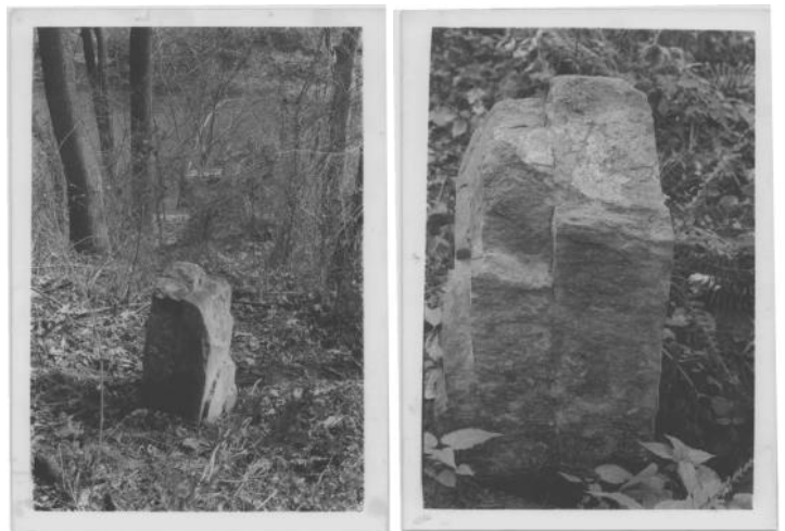
The New Munster stone