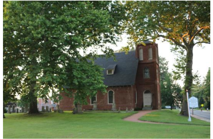
Manokin Presbyterian Church, Princess Anne Maryland