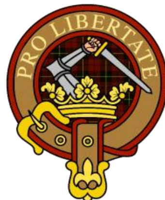
Clan Badge of Clan Wallace