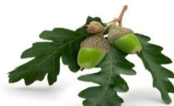
Plant Badge of Clan Wallace: Sprig of oak fructed proper (acorn).