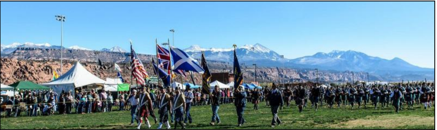
The Massed Bands and the Color Party at the Moab Celtic Festival.

Tucson's Celtic Festival is held on October 30th through November 2nd, 2014 at Rillito Raceway Park, an excellent facility for folks from around the greater Tucson region. Just a short distance north of downtown, easy access to plenty of space for clan and vendor tents, and plenty of parking for participants and visitors. For those in the clans, this was probably their last event for the year, but some of the vendors were looking forward to the Salado Games in central Texas one week later, that being their last stop for the season.