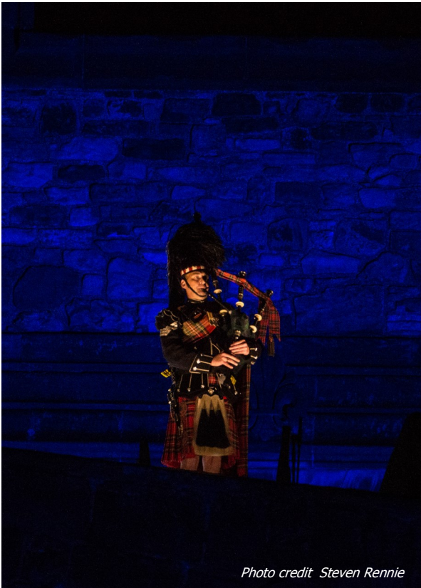
The Lone Piper