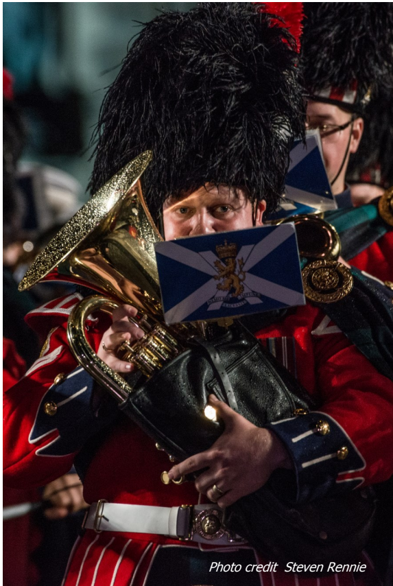
The Royal Regiment Of Scotland