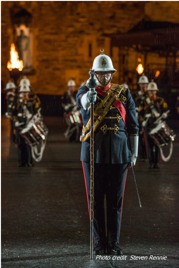
Her Majesty's Royal Marines