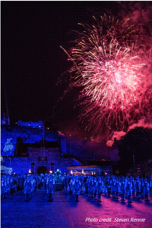
Fireworks Over The Castle