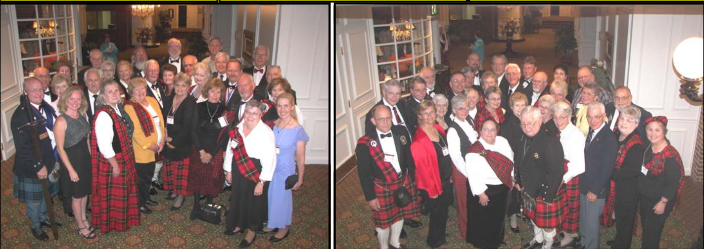
Pictures from the Farewell Dinner at the Hospitality House (across from William and Mary College) on Sunday September 30, 2007. This is as close to a group picture as we had. The meal was excellent and a good time of fellowship and recognition of achievements was enjoyed by all.