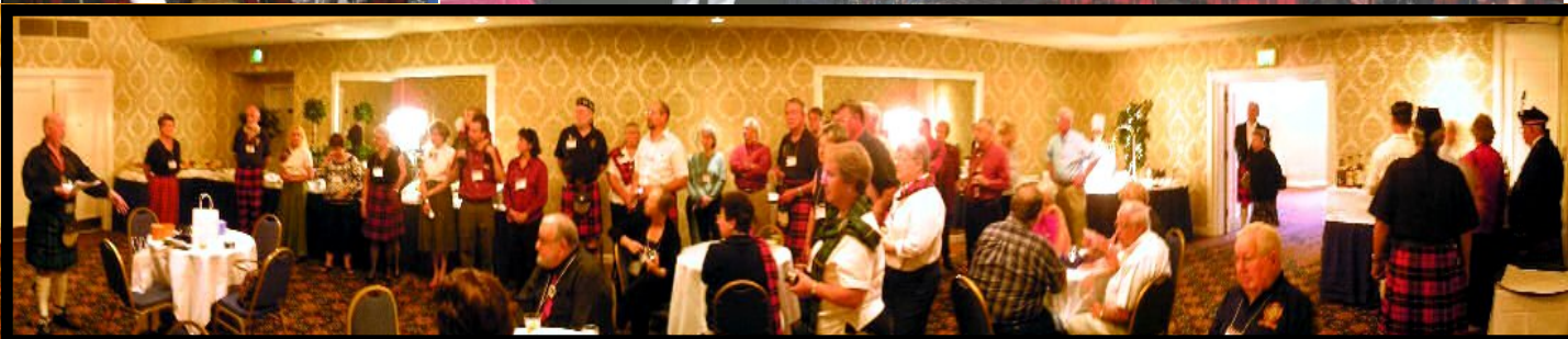
Gathering Reception on the official beginning of the festivities. The reception was held in The Hospitality House across from William and Mary College.