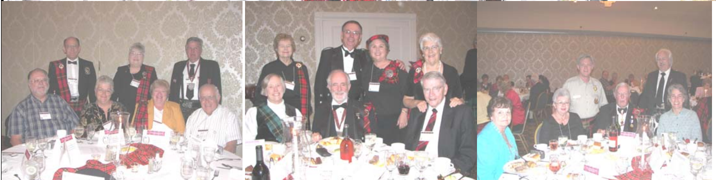
Table shots from the Farewell Dinner.