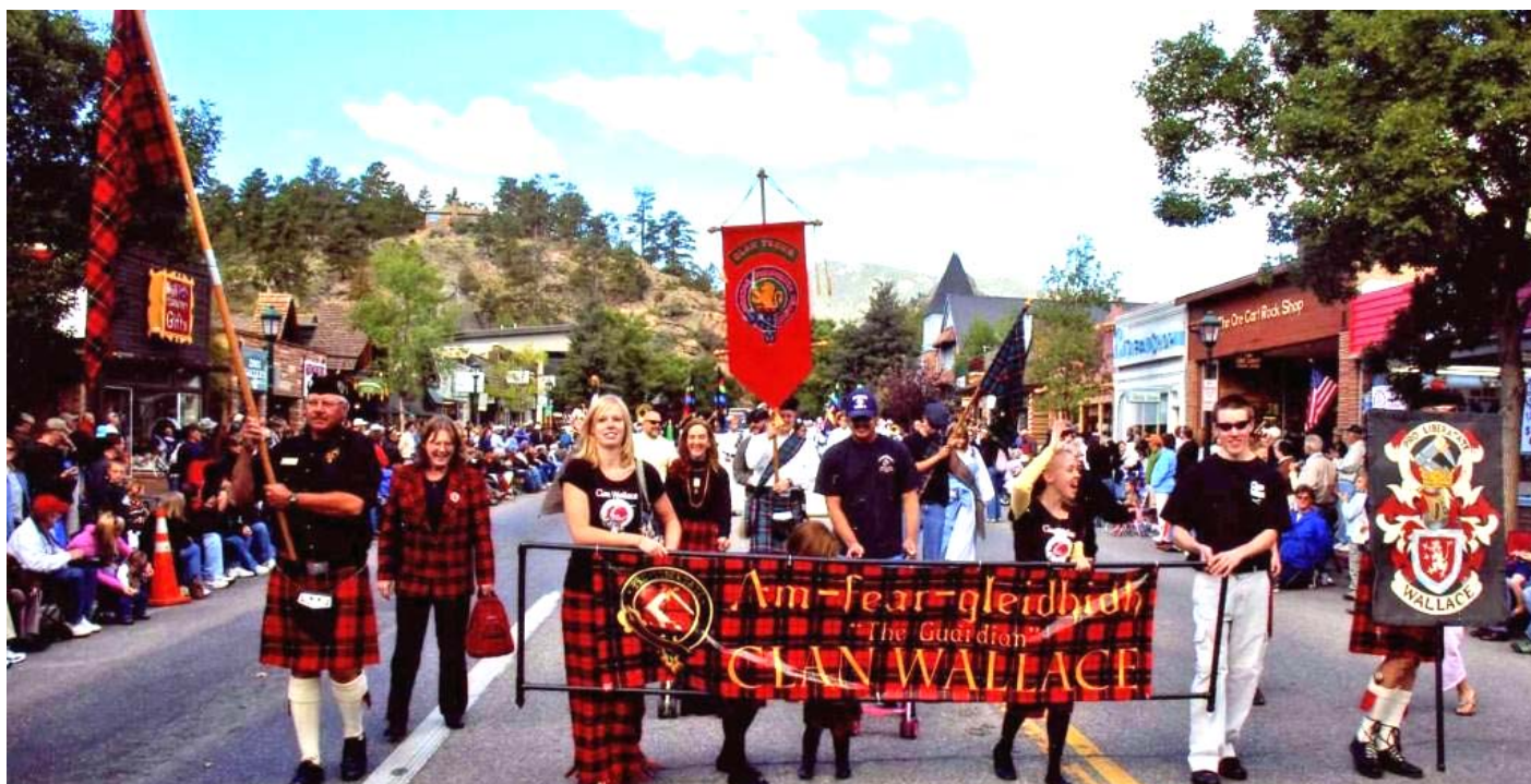
Wallace's on Parade at 2008 Longs Peak Scottish/Irish Festival and Highland Games, November 2008