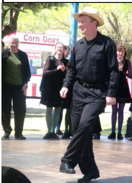
Fun Hard shoe Demo