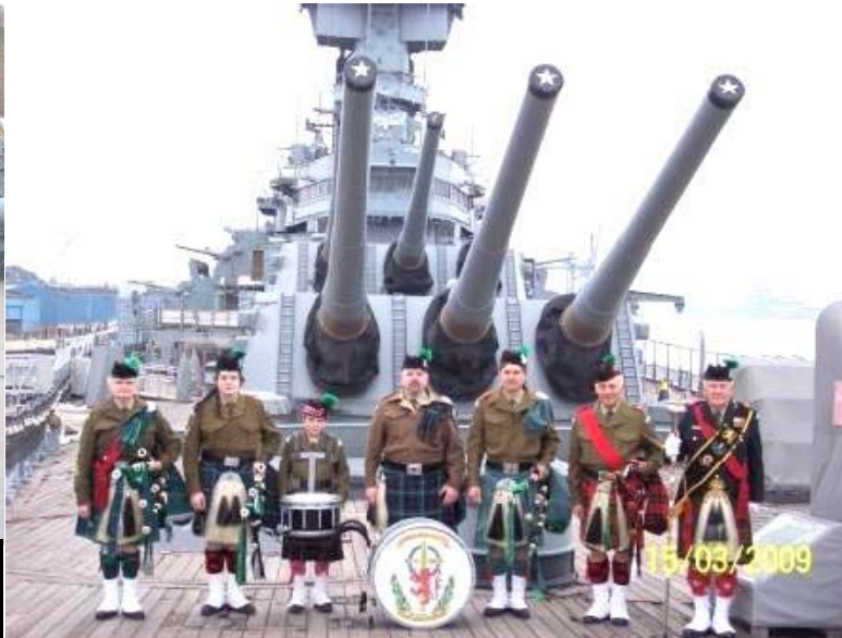
Select members of the Hamilton Celtic Pipes and Drums Band