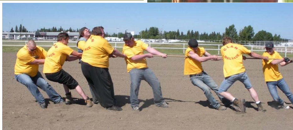
Tug-o-War at Red Deer, Alberta Canada