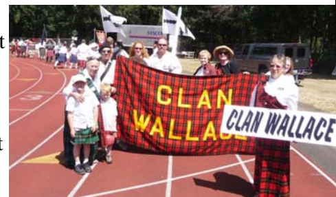
Photo of lined up to parade.