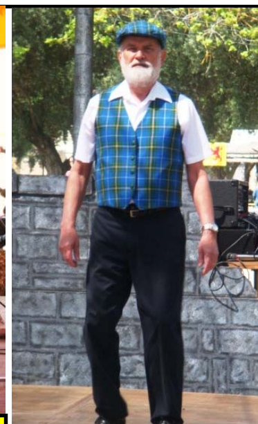
Step Dancer from Nova Scotia