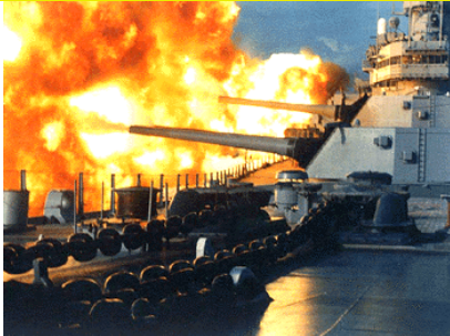
New Jersey firing all guns in a broadside. Ear plugs anyone?