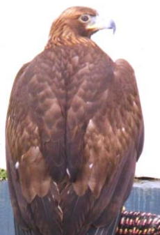
Raptor Rescue Group