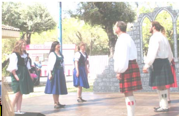
Scottish Country Dancing at Sacramento Games