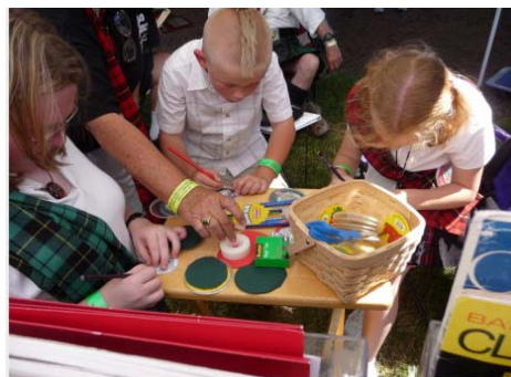
Photo of kids making pin on badges.