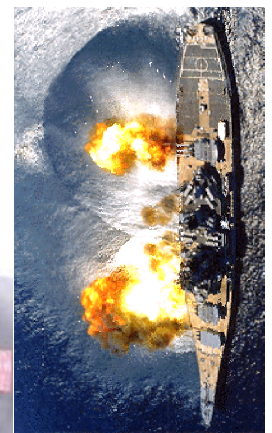
All 9 sixteen inch guns firing in unison.