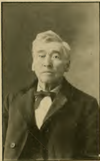
AMCS RAGAN, HIGH POINT, N. C.