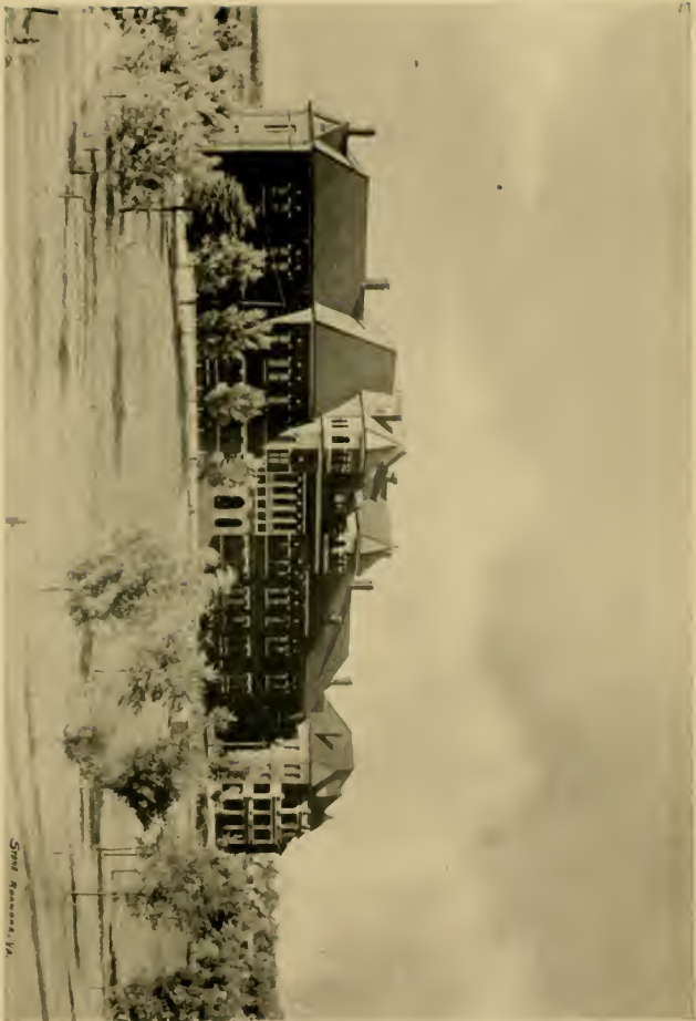
State Normal, Va.