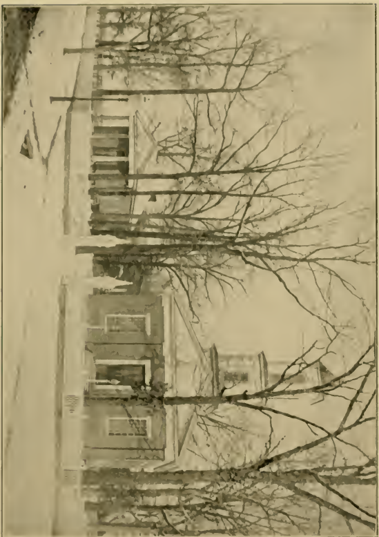
OLD FIRST PRESBYTERIAN CHURCH OF GREENSBORO.