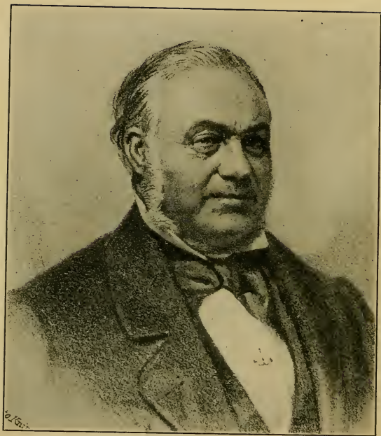
JOHN M. MOREHEAD, INTERNAL IMPROVEMENT GOVERNOR OF NORTH CAROLINA.