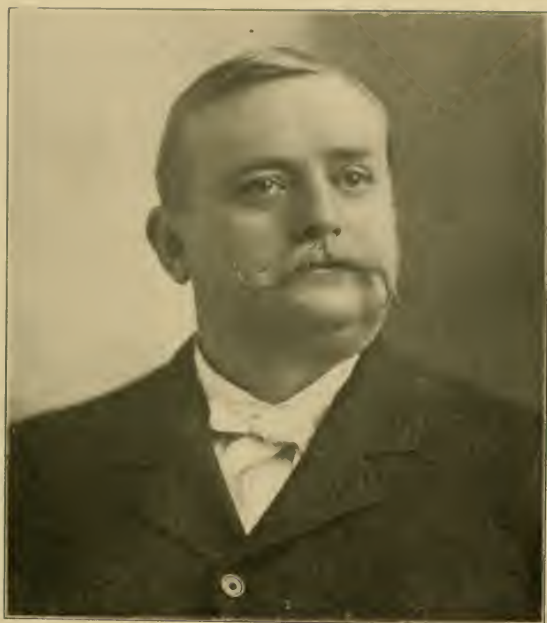
COL. W. H. OSBORN, HEAD OF KEELEY INSTITUTE IN NORTH CAROLINA, MAYOR OF GREENSBORO.