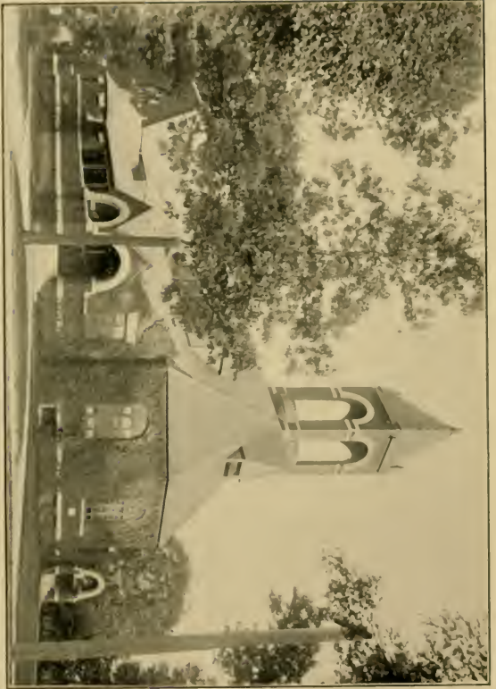
NEW FIRST PRESBYTERIAN CHURCH.