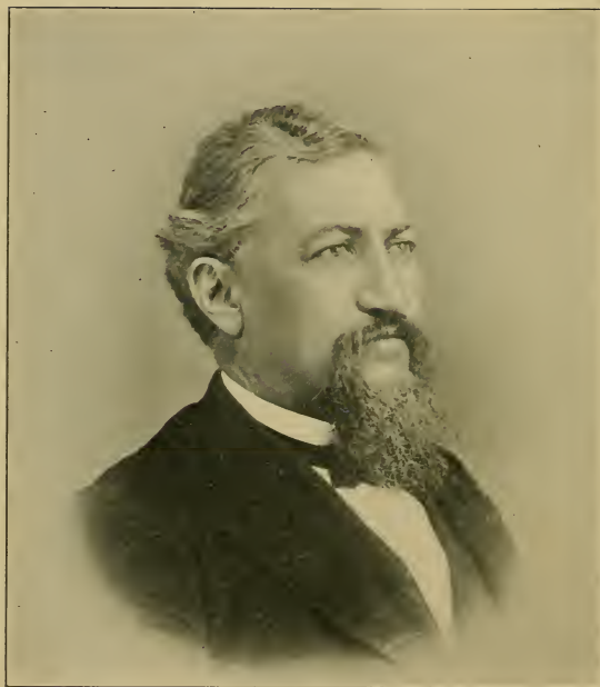
JUDGE JOHN A. GILMER, LAWYER, SOLDIER, STATESMAN. SEE PAGE 172.