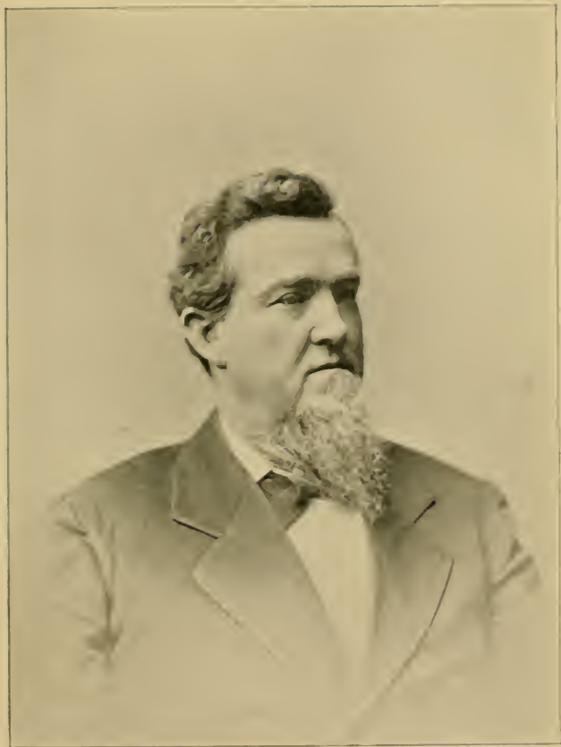
ALFRED MOORE SCALES, GENERAL IN THE CONFEDERATE ARMY IN NORTHERN VIRGINIA, GOVERNOR OF NORTH CAROLINA, ELDER IN THE FIRST PRESBYTERIAN CHURCH OF GREENSBORO, LAWYER-STATESMAN.