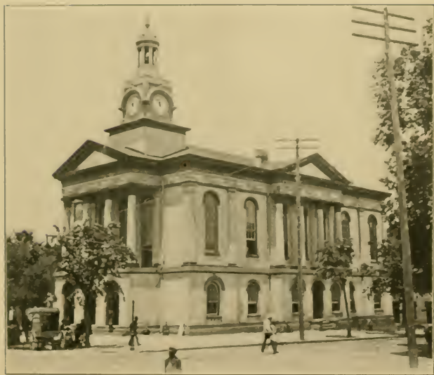
COURTHOUSE OF GUILFORD COUNTY.