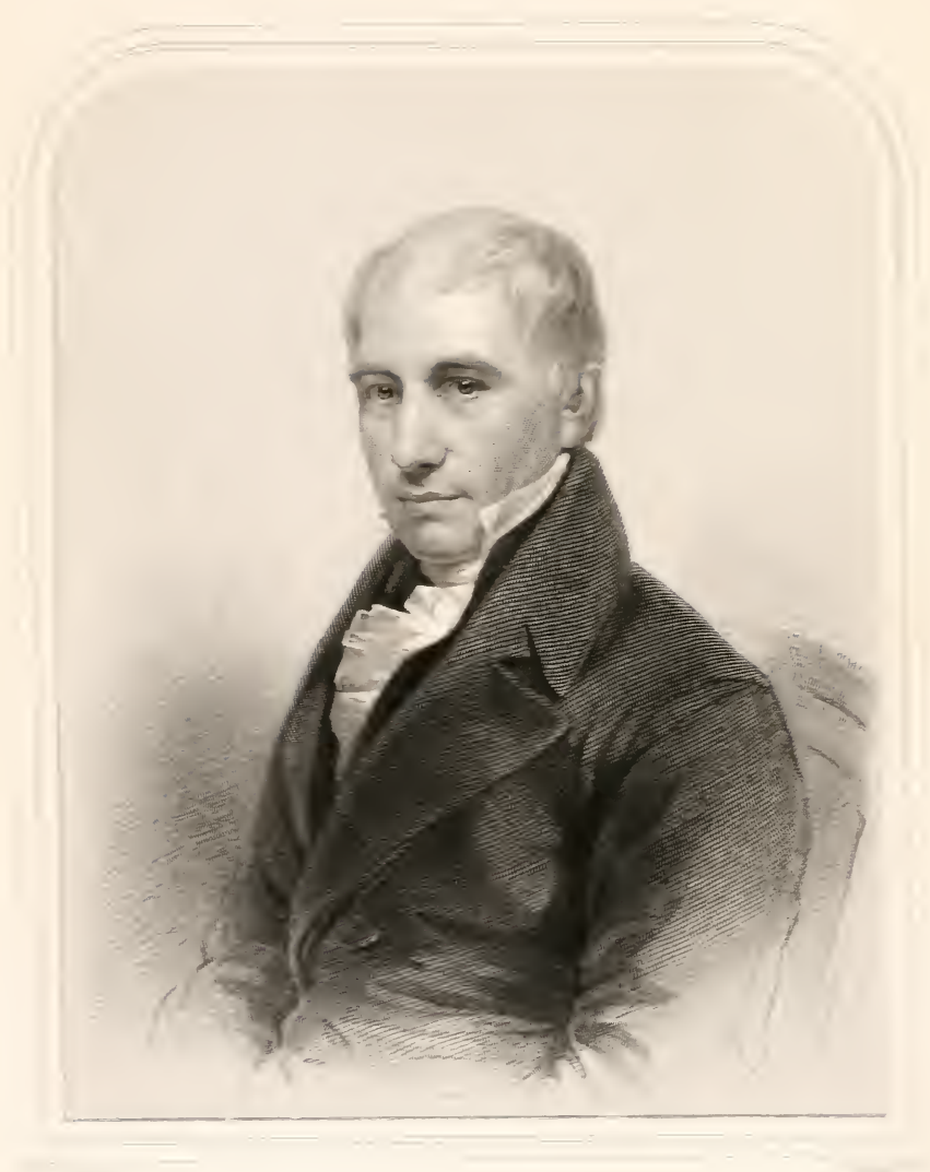
Portrait of [Name] [Title] [Date]