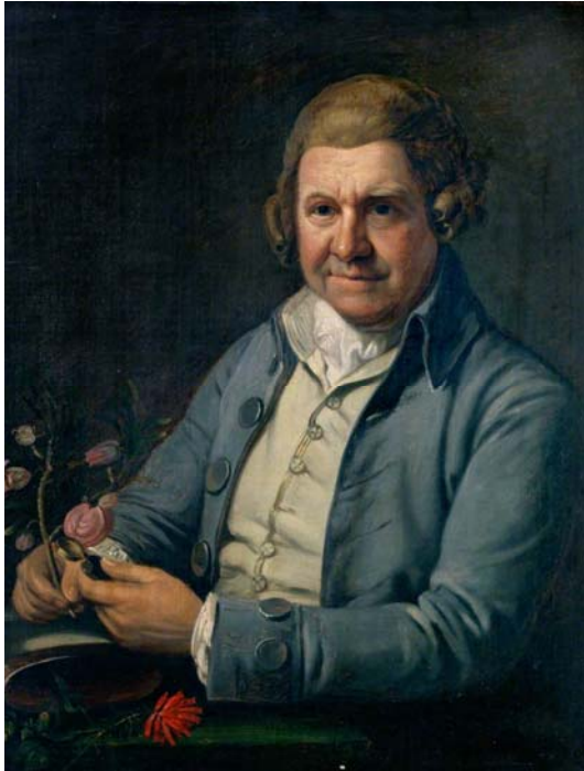
William Aiton (1731-1793)