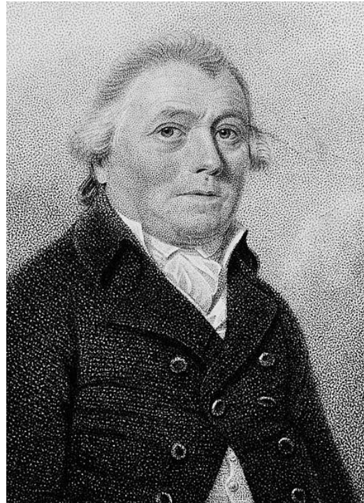
William Forsyth 1737-1804