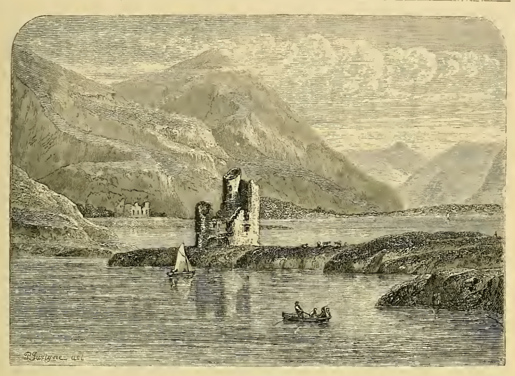
Castle of Ardyraick.

who was superior to all those reproaches which they had prepared the people to pour out upon him in all the places through which he was to pass," ^4