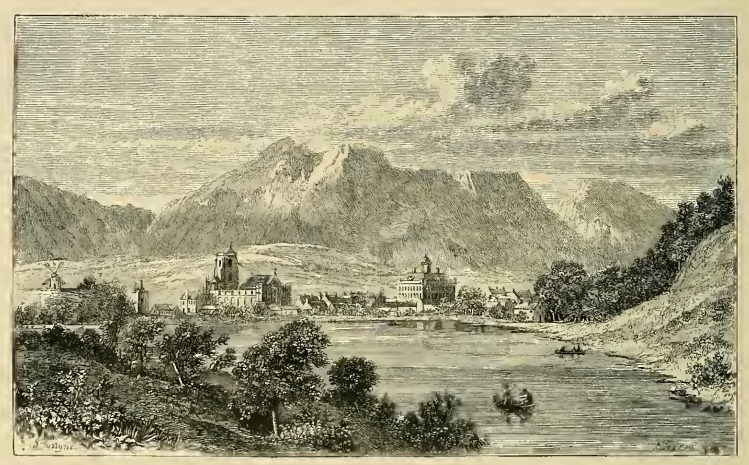
Dunkeld in the 17th century .- From Slezer's Theatrum Scottee.

Aware of his fate, he attempted to gain Dunkeld-house, lest his men, seeing him expire, might become dispirited; but he was unable to reach the threshold, and expired in their presence.