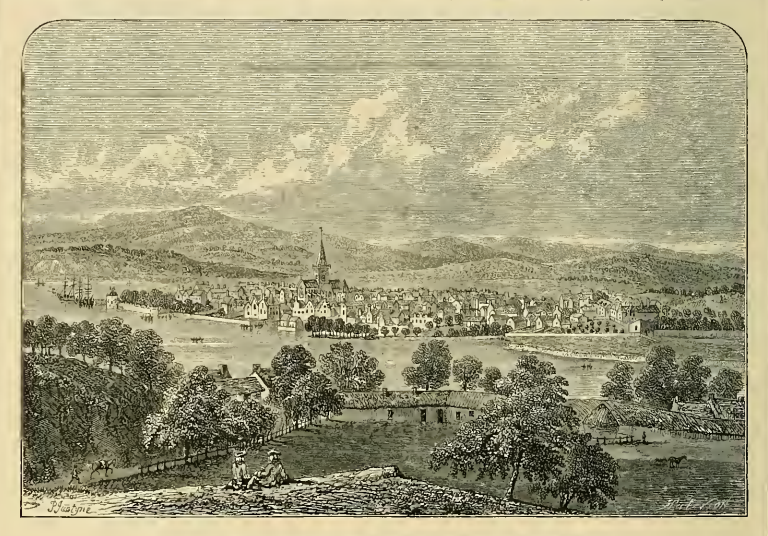
Perth in the 17th century .- From Slezer's Theatrum Scotice (1693).

chiefs, among whom stood conspicuous the renowned captain of elan Ranald, in himself a host. The elans were animated by a feeling of the most unbounded attachment to what they considered the cause of their chiefs, and by a deadly spirit of revenge for the cruelties which the Covenanters under Argyle had exercised in the Highlandes. The Macleans and the Athole Highlanders in particular, longed for an opportunity of retaliating upon the covenanting partisans of Argyle the injuries which