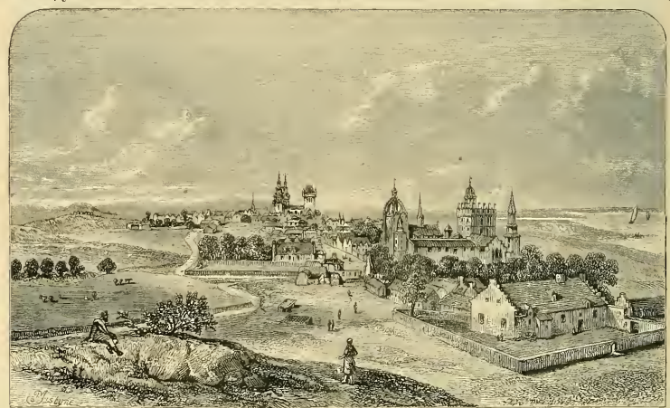
Old Aberdeen in the 17th century. - From Slezer's Theatrum Scotice (.693).

Deeside to Inverury, where he appointed a general rendezvous to be held on the 10th of May. Colonel Montgomery being aware of his motions, beat up his quarters the same night at Kintore with a party of horse, and killed some of his men. But Montgomery was repulsed by Lord Lewis Gordon, with some loss, and forced to retire to Aberdeen. The marquis appeared at the gates of Aberdeen at 12 o'clock on the following day, with a force of 1,500 Highland foot and 600 horse, and stormed it in three different places. The garrison defended themselves with courage, and twice repulsed the assailants, in which contest a part of the town was set on fire; but a fresh reinforcement having entered the town, under Lord Aboyne. the attack was renewed, and Montgomery and his horse were forced to retire down to the edge of the river Dee, which they crossed by swimming. The covenanting foot, after taking refuge in the tolbooth and in the houses of the Earl Marischal and Menzies of Pitfoddles.