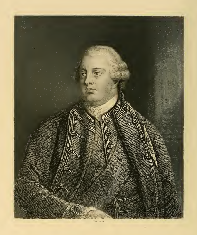
WILLIAM DUKE OF CUMBERLAND