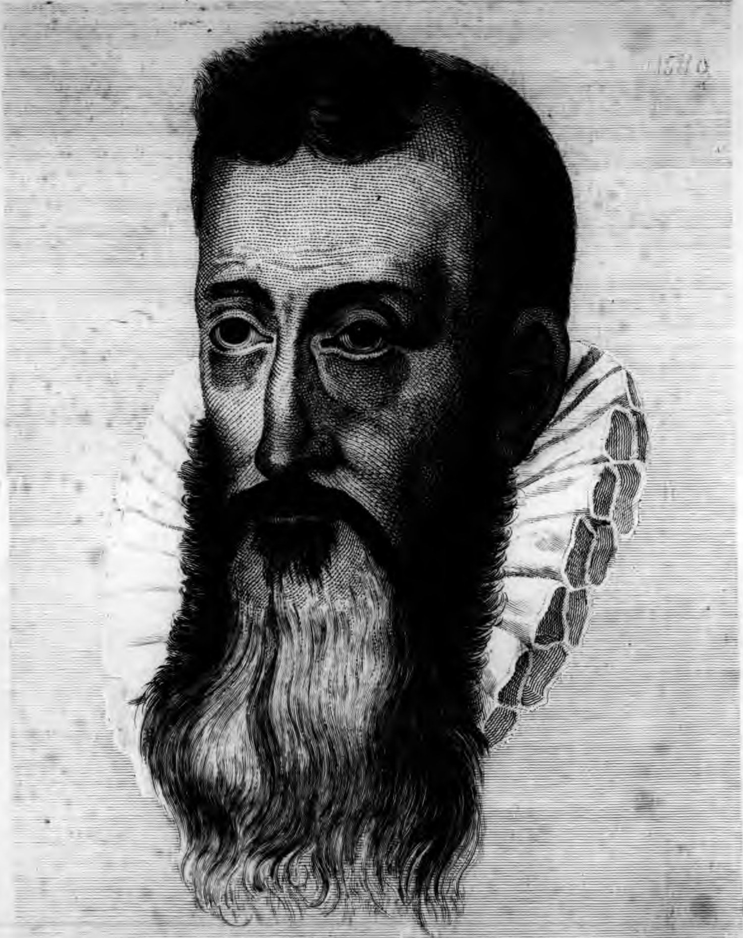
G. Talbot Earle of Shrewsbury