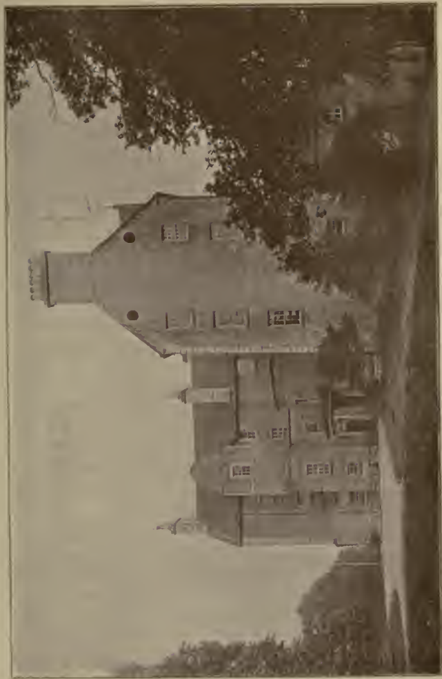
Calder House, Mid-Lothian Where Chopin resided during his visit to Scotland in 1848