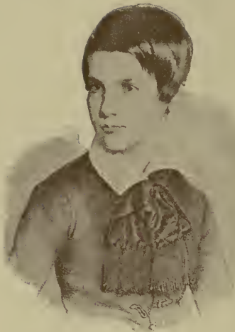
Carl Filtsch, infant prodigy Pupil of Chopin