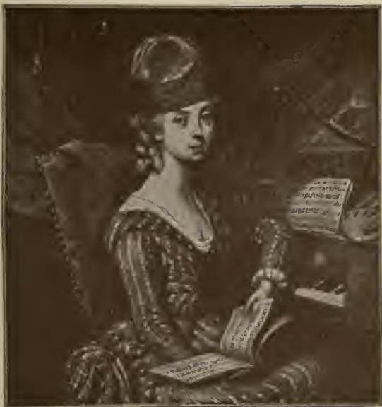
Marcelline Czartoryska, née Princess Radziwill Pupil of Chopin