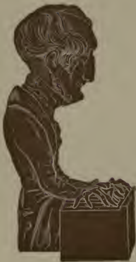
After Dantan's Caricature of Thalberg