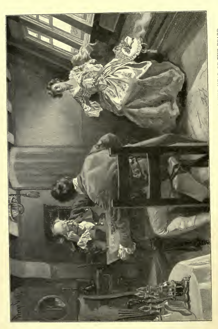
I SAT UNEASY, LIKE A SMALL PAWN THAT HAD BEEN TRYING TO GET TO THE HEAD OF THE BOARD. (PAGE 174.)