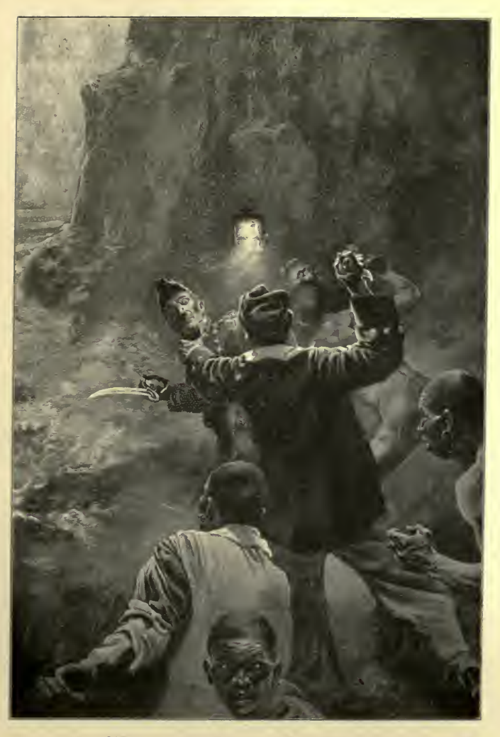
THE FRENCHMAN'S RED CAP AND HIS DARK, FIERCE FACE GLARED ON ME BY THE LIGHT OF THE LANTERN.