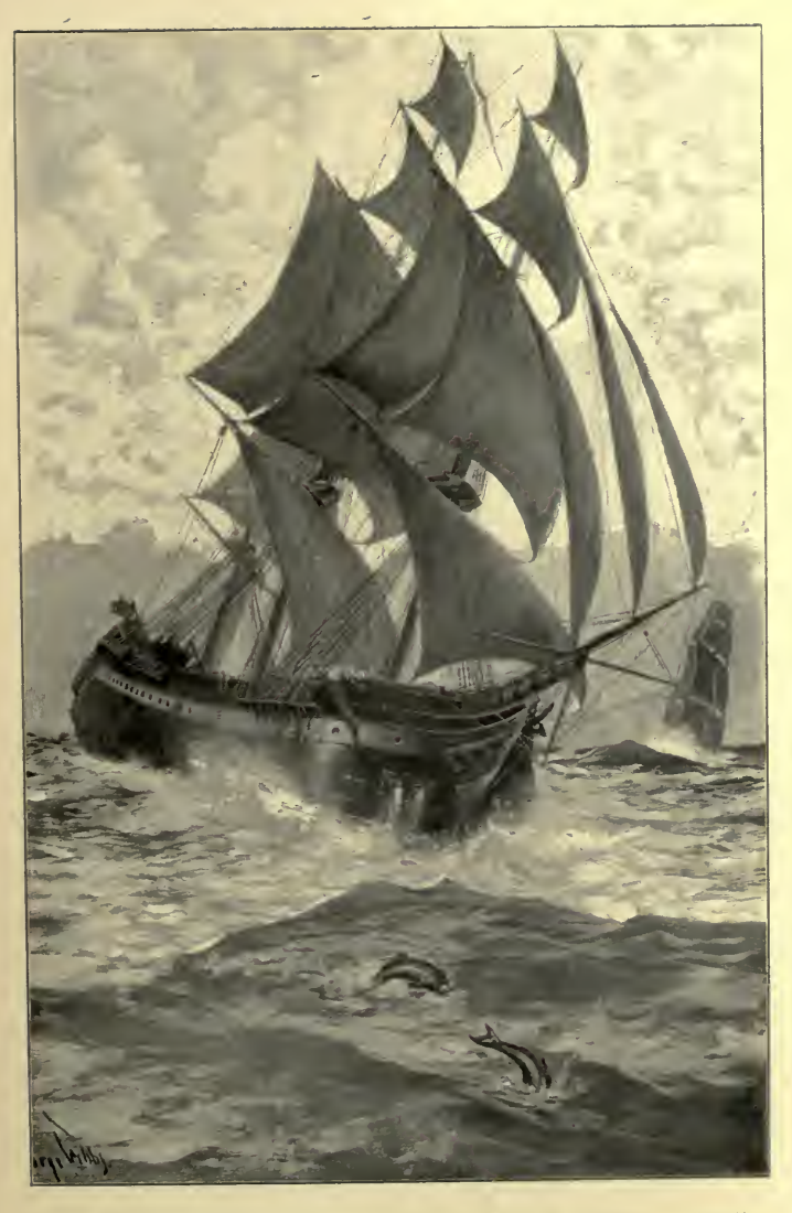
NEXT MINUTE THE FIRE OUT OF ONE OF HER BOW-CHASERS FLASHED OUT BEHIND THE BLUE BACK OF A SWELL.