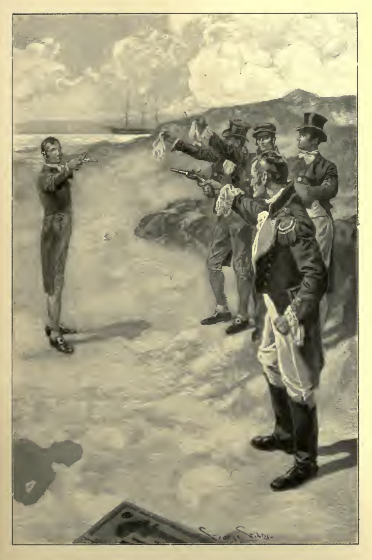
THE SECONDS GAVE THE WORD TO EACH OTHER, AND DROPPED TWO WHITE HANDKERCHIEFS AT ONCE.