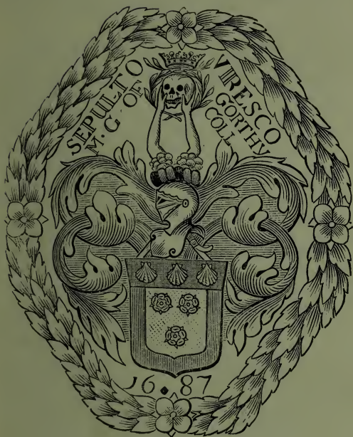
Archery Medal of MUNGO GRAHAM OF GORTHY--1687. ( Page 466. )