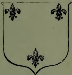
Arms on Seal of Catherine Gorthy—1557. (Page 415.)