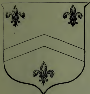
Arms on Seal of Tristram of Gorthy—1464. (Page 408.)