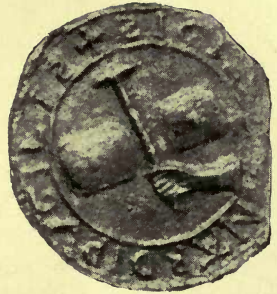
'+ SIGILL' BERNARDI PVGILIS'