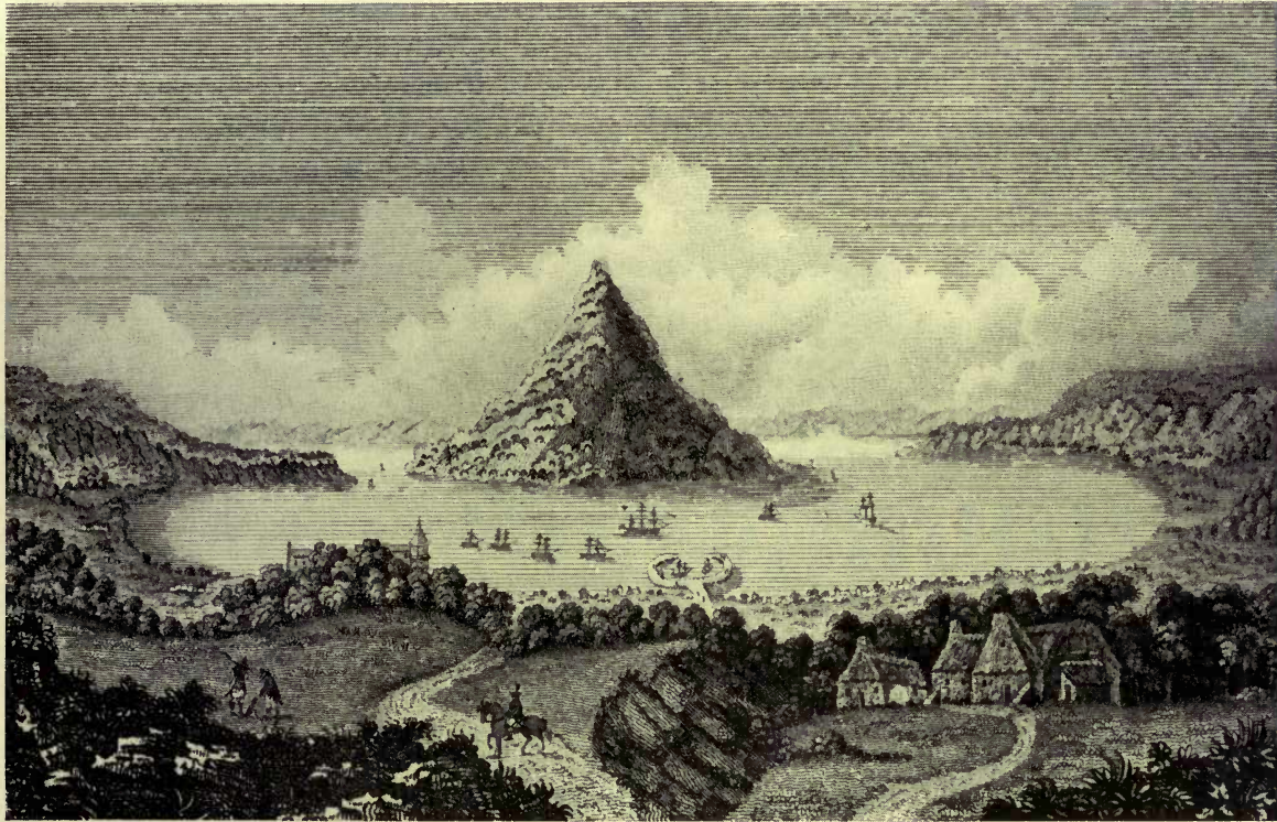
LAMLASH, SHOWING DUCHESS ANNE'S HARBOUR.