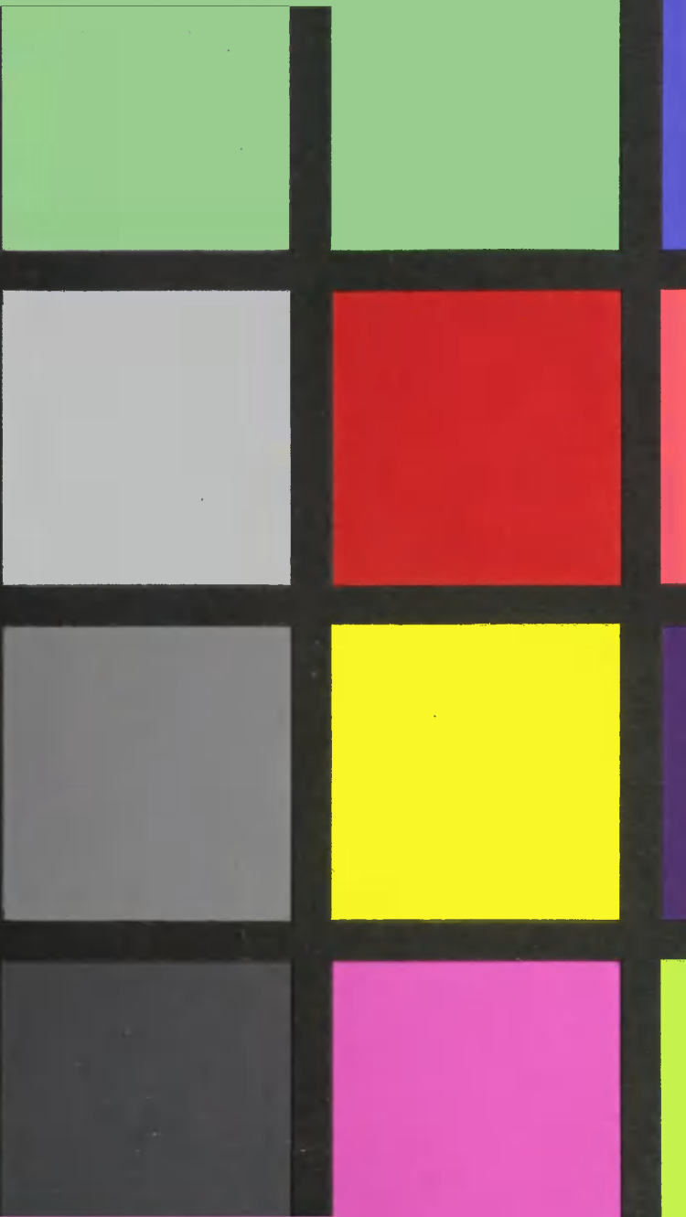
GretagMacbeth™ ColorChecker Color Rendition Chart