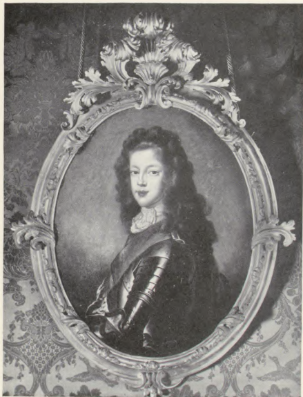
JAMES FRANCIS EDWARD STEWART