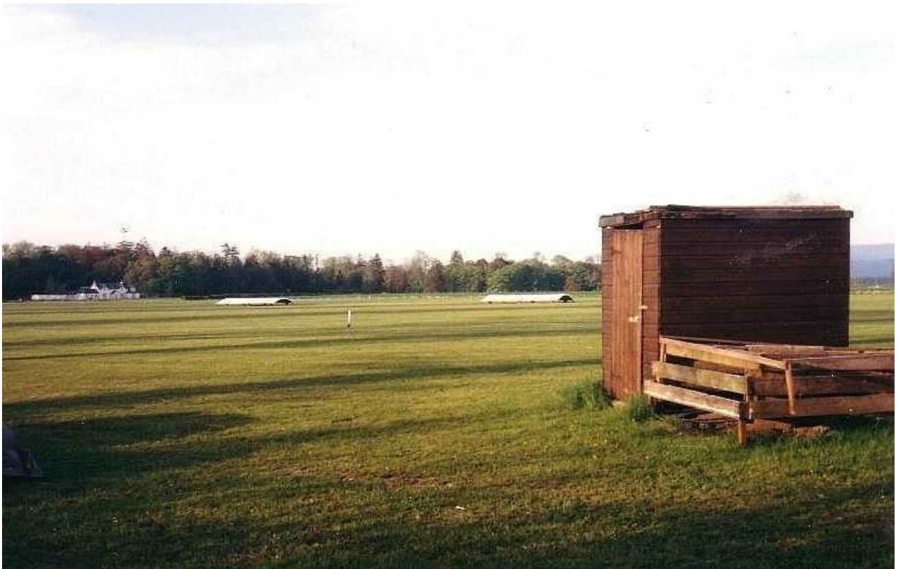
Meiklewood Cricket Ground, Gargunnock in the Summer of 1994