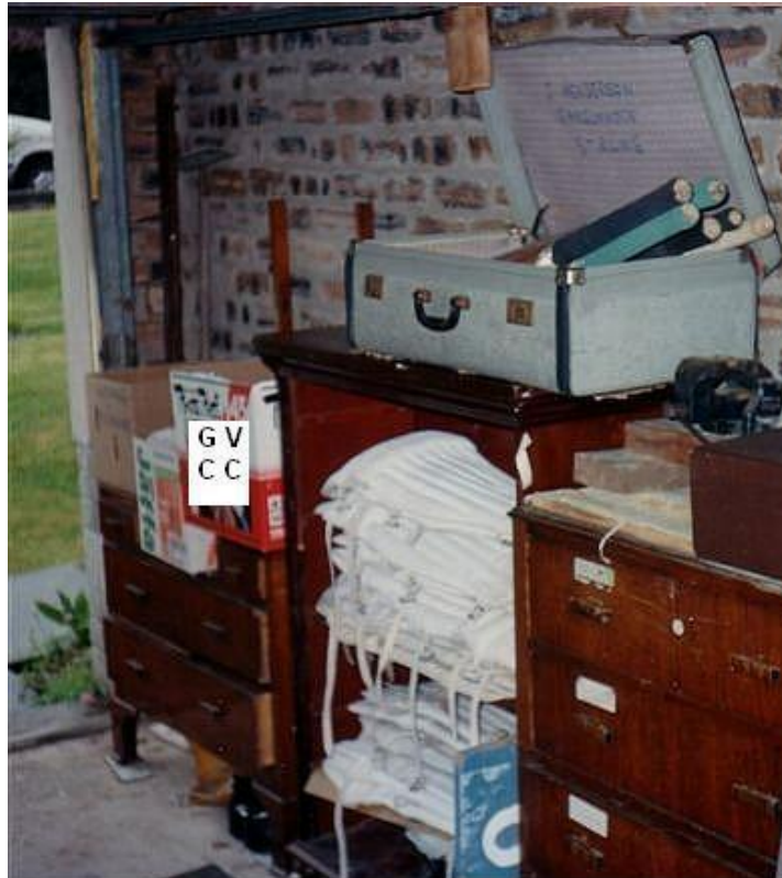
Henders' GVCC Equipment Store