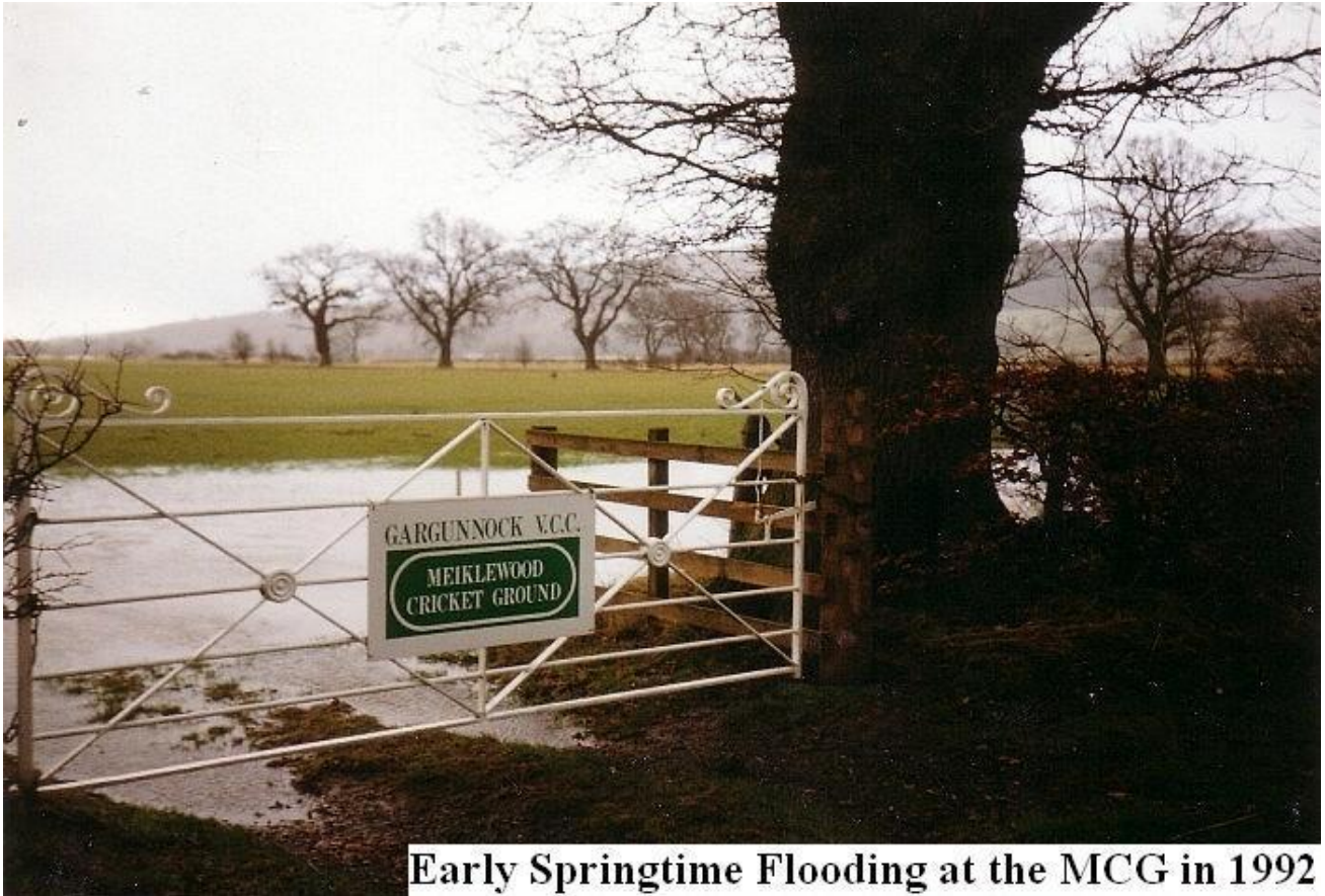
Early Springtime Flooding at the MCG in 1992