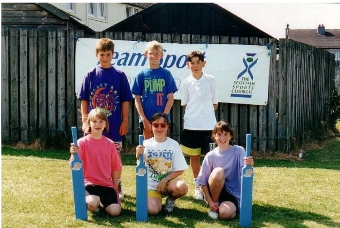
GVCC's Kwik Cricket Six who took part in a tournament organised by the club within Provost Park, Gargunnock in July, 1992.