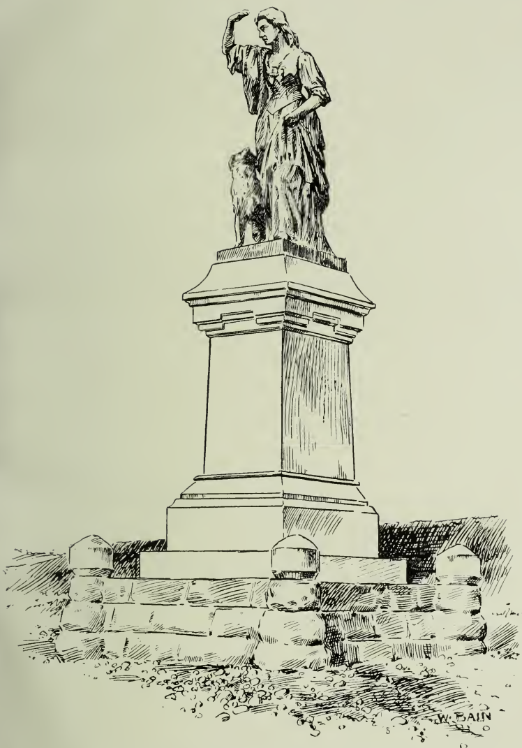
FLORA MACDONALD STATUE, INVERNESS.