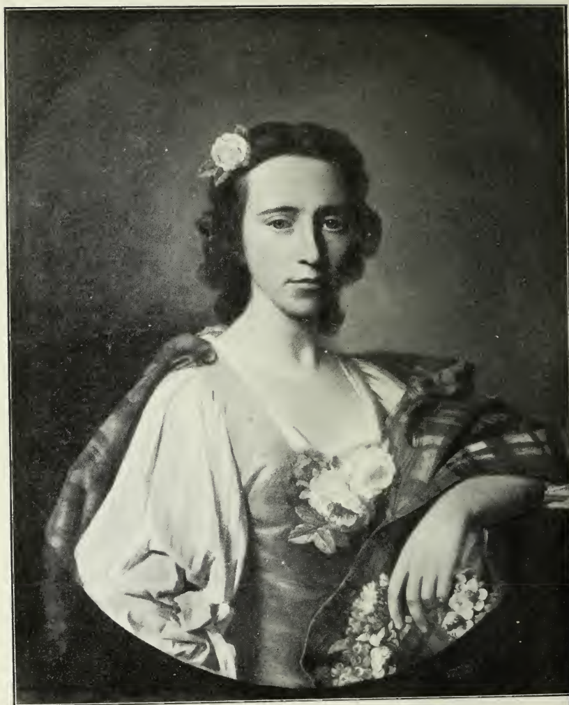
FLORA MACDONALD. FROM ALLAN RAMSAY'S PAINTING FROM LIFE.