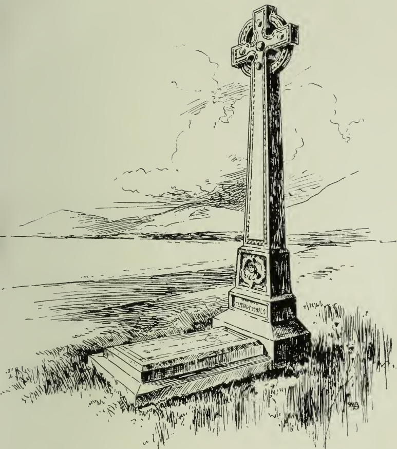
FLORA MACDONALD'S MONUMENT, KILMUIR, SKYE.