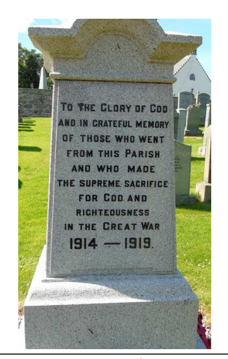
Stanley Bruce 2015