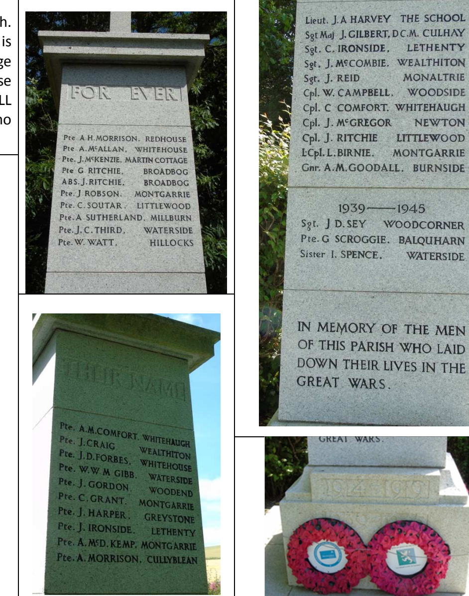
Stanley Bruce 2015