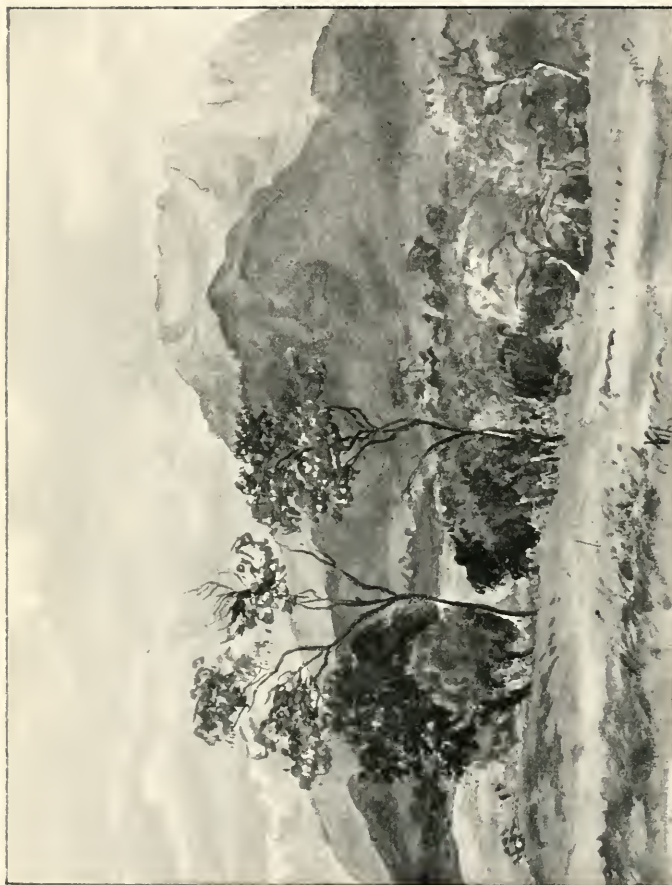
MOUNT PINGUE, FROM THE LIMBE BUNGALOW.