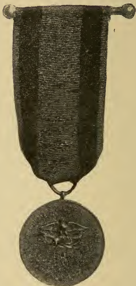
United States Army INDIVIDUAL SERVICE MEDAL