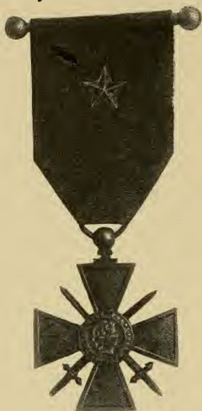
CROIX DE GUERRE

One beautiful, romantic feature of French army life is the adoption of soldiers by god-mothers. In one instance, a girl fifteen years of age, having enough money, adopted a half dozen. One of them proved to be a Senegalize, who wished to take the young lady back to Africa to complete his harem!