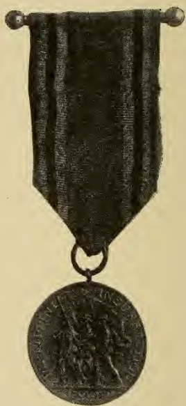
UNITED STATES CON- GRESSIONAL MEDAL

Americans there endured pain and suffering, the depth of which Washington's Army at Valley Forge never reached. Those old Continentals had nothing in discomfort on these modern heroes in front of Croane. Washington's Army, in their own country, had access to the necessities of life. They held communion with their fellows. These later-day Americans, un-