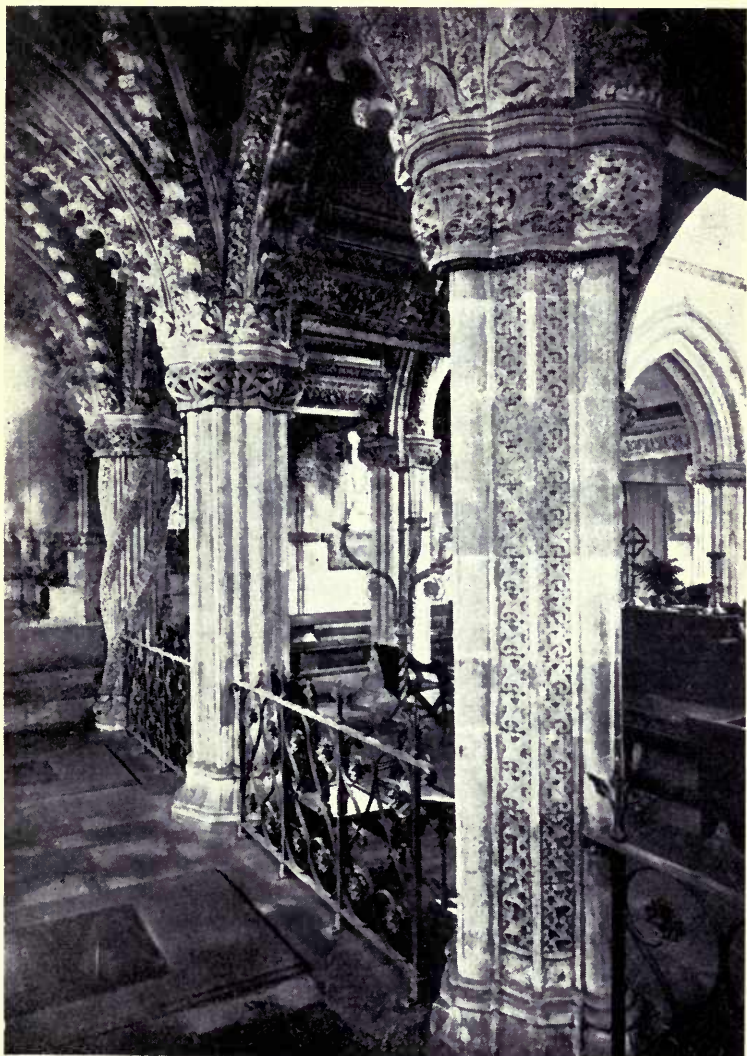
THE THREE PILLARS OF EASTERN CHAPELS