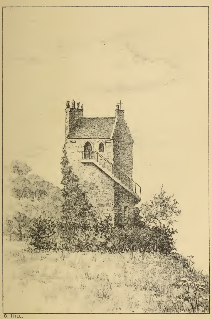
ROSS'S FOLLY, TAKEN DOWN IN 1825.