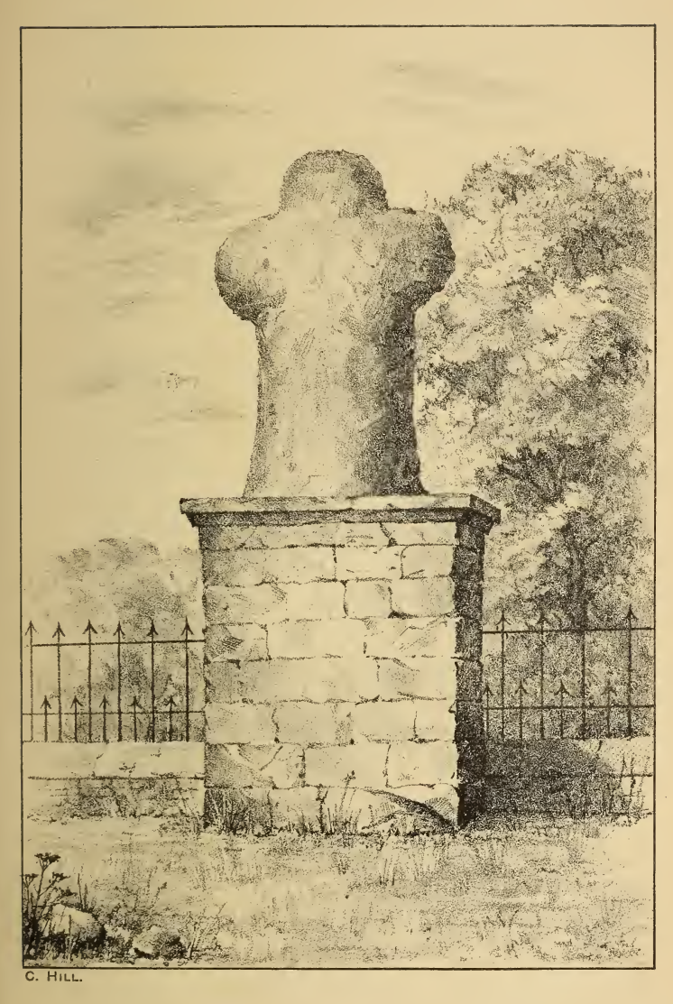
STONE INTENDED FOR A PORTION OF A STATUE OF OLIVER CROMWELL.