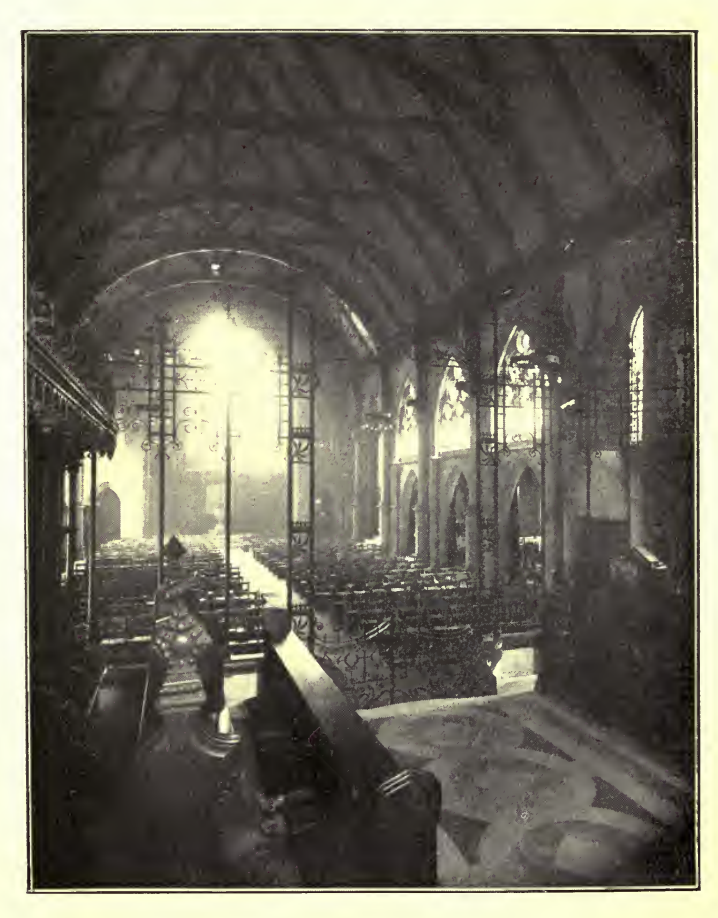
VIEW OF THE INTERIOR OF OLD ST. PAUL'S FROM THE ALTAR, SHOWING THE SEABURY CHAPEL TO THE RIGHT