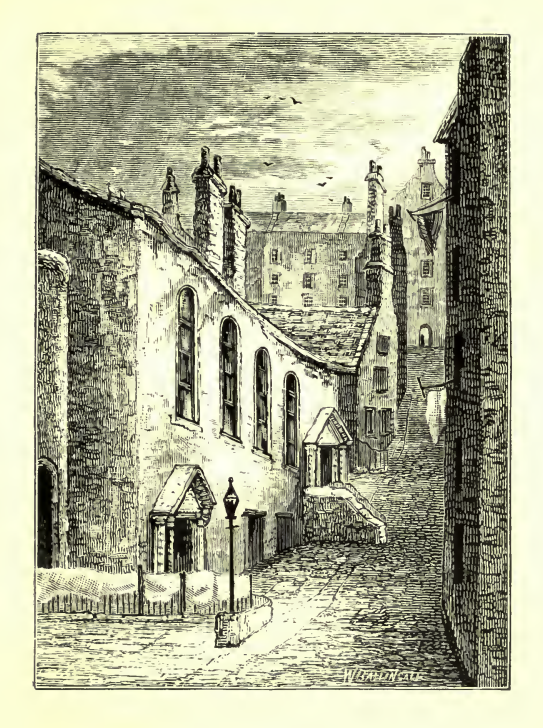
THE OLD CHURCH IN CARRUBBER'S CLOSE